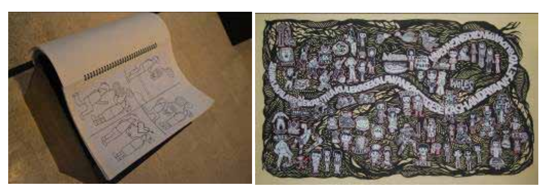
Figure 5. Presentation of comic book and panel.

In addition to the format presented in the book, this comic is also presented in a 2-dimensional panels are made with cut-out technique. Each character image affixed to the sponge and then cut at the edges. pieces of the character images are grouped and affixed on a bigger sponge. To add to artistic value, ornamented background on sponge are made with a cutting technique. This is in addition to add to artistic value, is also a space to put a tagline which I was able to represent the whole set of pictures of this comic.