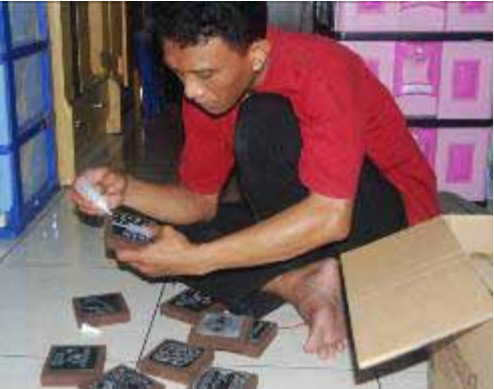
Figure 3. Making and installing the etching on wooden board (Collection : Adam Wahida, 2013).

Because of this artwork will be presented in the form of 2-dimensional installation, then I set up a hanger board of canvas size 140 x 200 cm, some nails fitted on the back of board for hooking a rope. The canvas is painted black and brown to resemble wood. When all is ready, the next etching board fitted red rope to hang on the canvas. Red rope to give contrast effect when arranged on black canvas. Compilation each etching on canvas is made randomly and unorganized to overlap one another. The idea of setting this artwork inspired by teens visual attribute setting such as pins, emblems, stickers, key chains, which are on display of randomly and overlap for sale in a store.