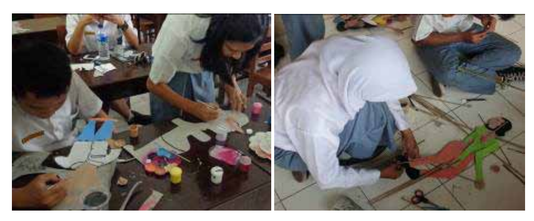
Figure 6. Students are coloring and put the handle of puppet. (Collection: Adam Wahida, 2014).

The creation of the artwork is started collecting comic puppet types and shapes that have been made. The presentation of an interactive artwork is created using a simple kinetic energy. Kinetic techniques have been selected to represent the proximity of the students to the environment. An interactive presentation through manual kinetic energy is expected to be the audience feel closer to the expression of these teens.