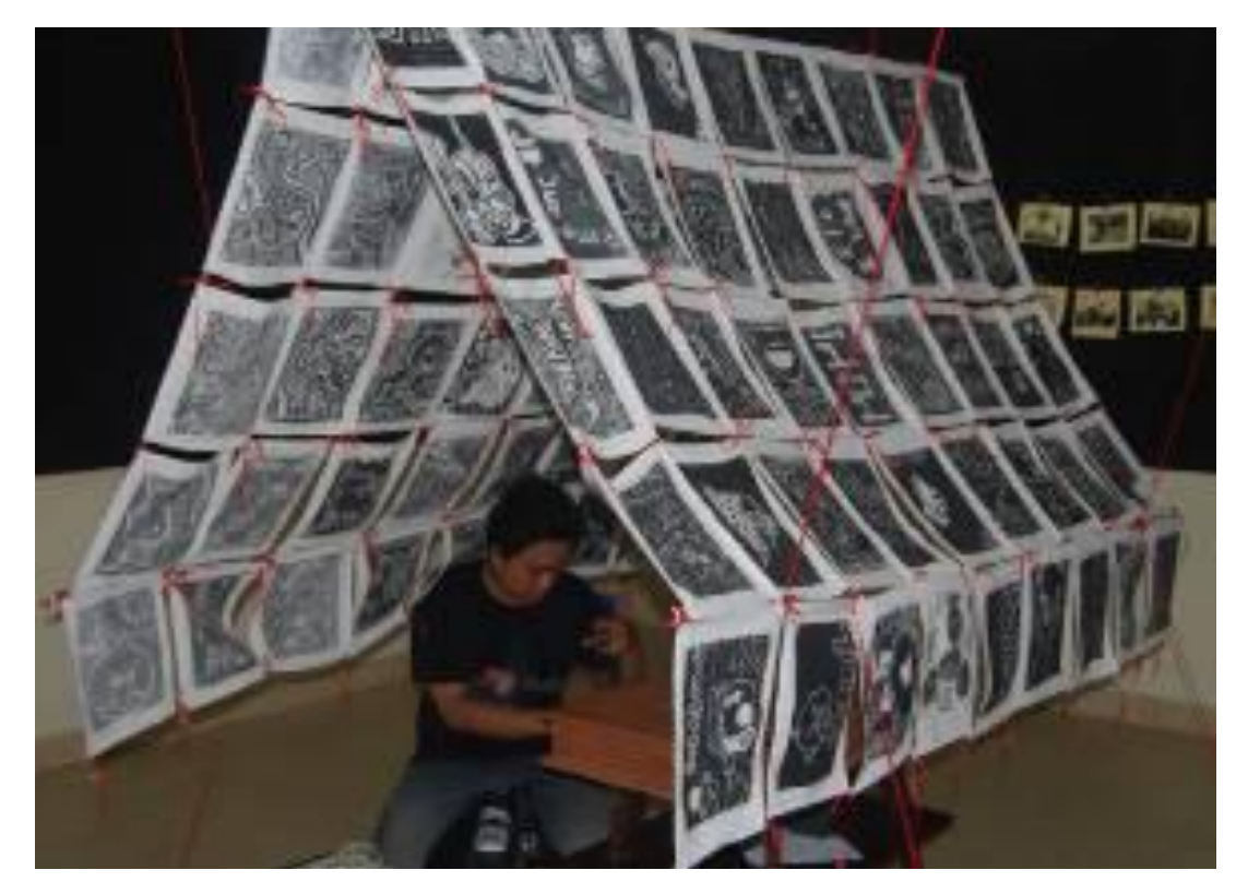
Figure 2. The process of organizing the inside of a tent. (Collection: Adam Wahida, 2013).

Visually, the work of graphic art is a ideas communication form between students who represented into a single unit. The practice of artwork creation is in line with the theory of relational aesthetics by Nicolas Bourriaud that art is a way to do exploration at the same media experiments on activities of communication between some people.