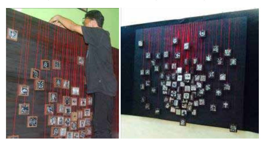
Figure 4. Thread installation and etching arrangement on canvas. (Collection: Haidar Ammar, 2014).

Because of this artwork will be presented in the form of 2-dimensional installation, then I set up a hanger board of canvas size 140 x 200 cm, some nails fitted on the back of board for hooking a rope. The canvas is painted black and brown to resemble wood. When all is ready, the next etching board fitted red rope to hang on the canvas. Red rope to give contrast effect when arranged on black canvas. Compilation each etching on canvas is made randomly and unorganized to overlap one another. The idea of setting this artwork inspired by teens visual attribute setting such as pins, emblems, stickers, key chains, which are on display of randomly and overlap for sale in a store.