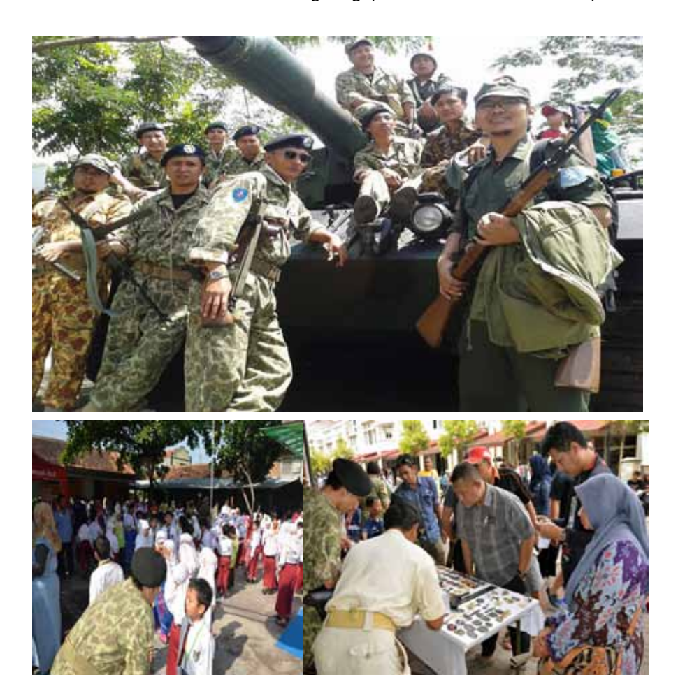
Figure 2. Reenactors' activityin historical dispay of the military in Bandung, 2014 (Collection: Hosea Bimo's).