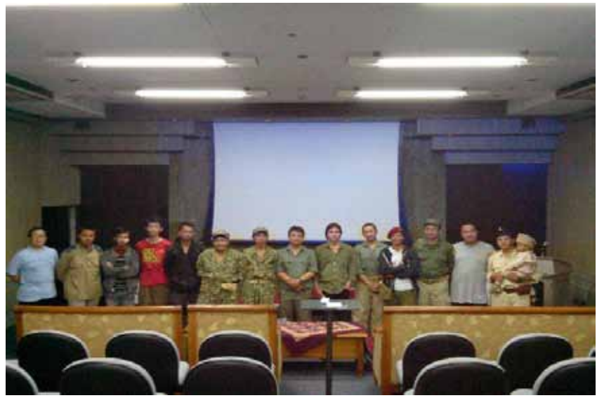
Figure 3. Activity of watching the film Fury (above), and discussion on the film Oeroeg (below), reenactor members of HvB in Bandung. Top picture: One of the reenactorswas putting on KNIL's army costumes with bagde Andjing NICA's blue badge. (Collection: HvB, 2015).