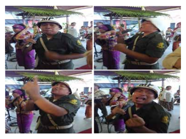
Figure 6. KNIL's costumesworn by an amateur singer at a wedding party in Magelang.