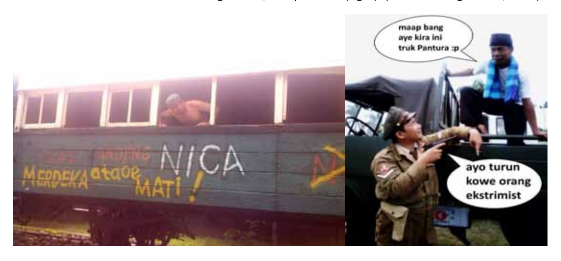
Figure 13. The picture of KNIL bare-chestreenactor on a railway coach of Ambarawa Museum (left). The picture of HvB reenactor 2013 (right).