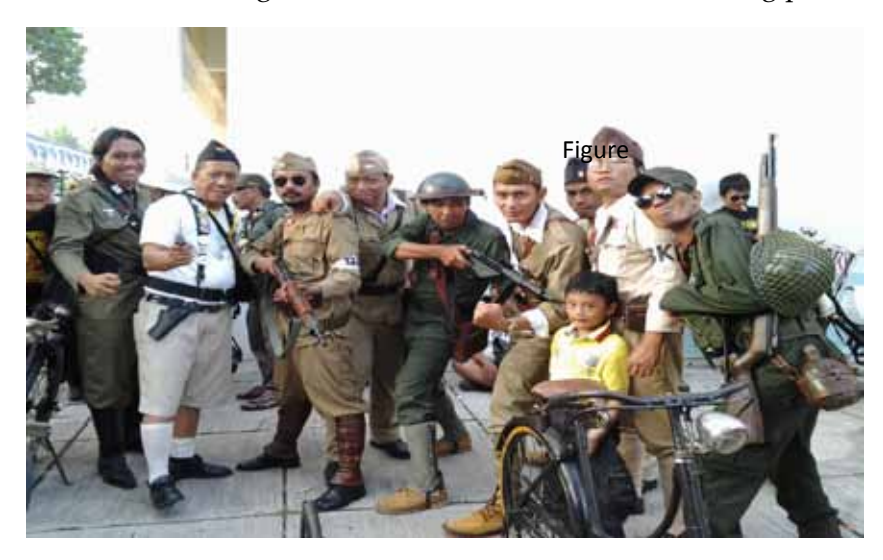
4. Various reenactors' impressionof bicyclers' (called ontelis in Indonesian) military costumes of 1940sin old bicyle riding in Surabaya 2012. (Collection: Rubbin Nanda's, 2012).

While Parallel Stage activities can be seen in the following pictures: