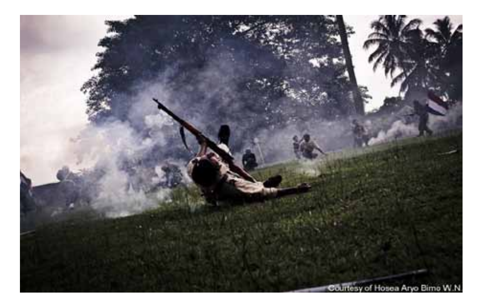
Figure 1. Reenactors' activityin theatrical action celebrating Magelang Battleground Rises Again, 2014 in Magelang.