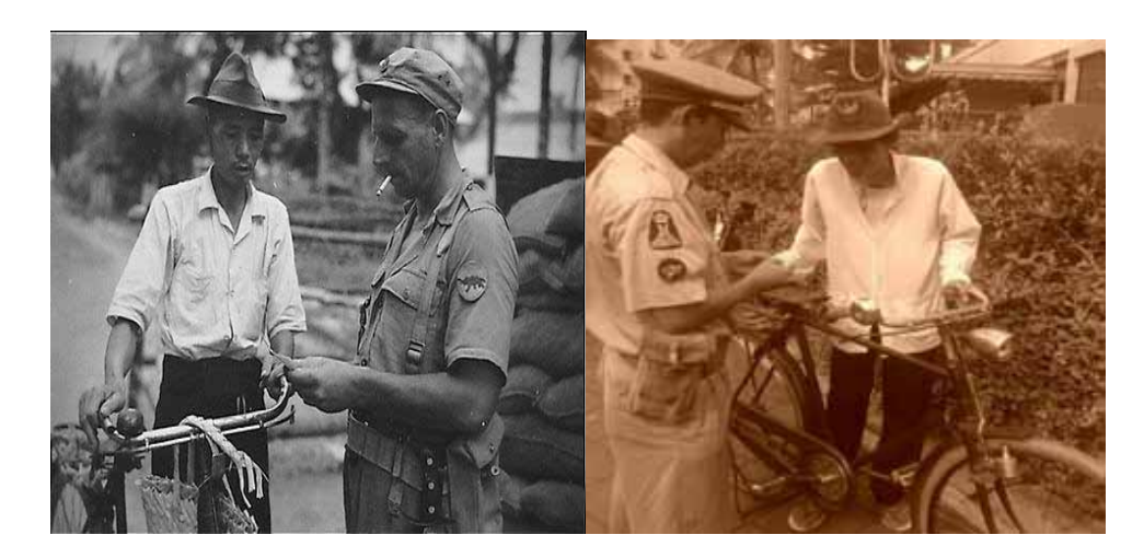
Figure 9. The picture on the right is a costume and setting imitation of past scene from the picture on the left. (Collection: Agung Setiawan's, 2014).

The word 'mimicry'according to Glossarium Indonesian Dictionary(2014) means a form of behavior or appearance that first grows in some animals, especially insects, in which the species imitates other species in terms of behavior or appearance as a way to avoid threat in a confrontation with predators. The example is a flower fly, many of which look like bees. The concept of mimicryfirst introduced by Franz Fanon in Black Skin, White Mask (1952) saying that the colonized people were forced to take off their traditional view of their selves and national identity and then started to learn to adapt their identity with their masters'.