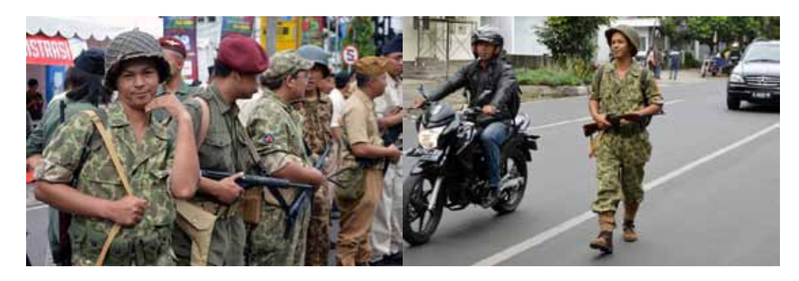
Figure 12. A KNIL reenactor with 'transgender' impression (left). The second picture is entitled 'STREES' on the Facebook wall of Agus KNIL, 28 April 2015 (right).