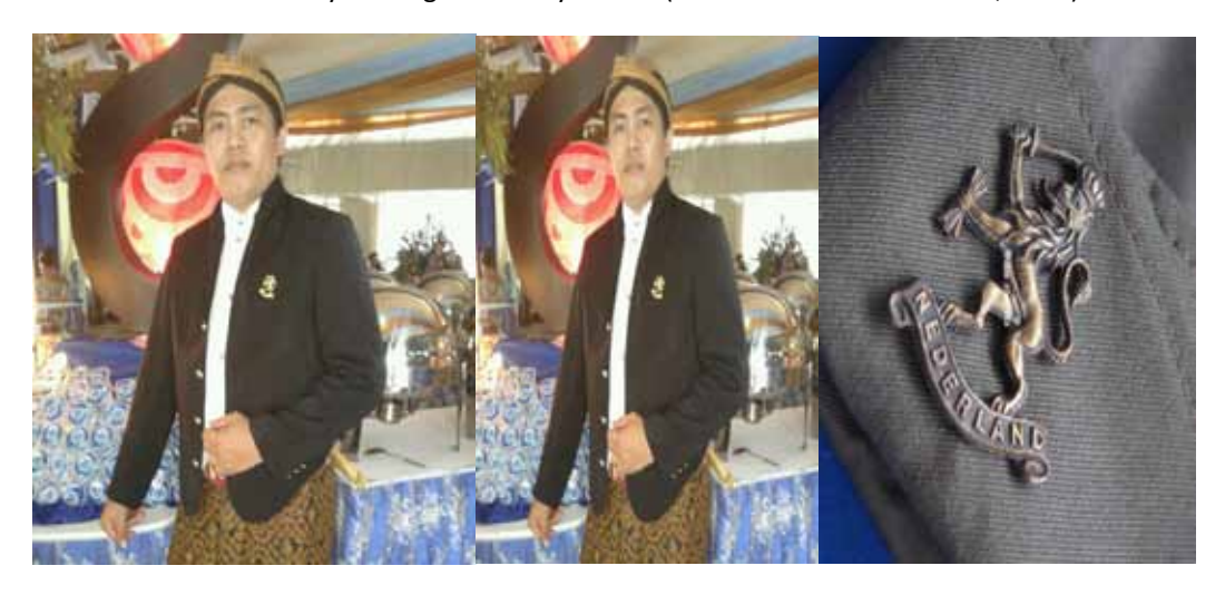
Figure 5. Maitendraai Koninlijk Insignia KNIL's pinattached on Javanese tight-fitting short jacket at a wedding ceremony. (Collection: Febri Asnan's , 2014).