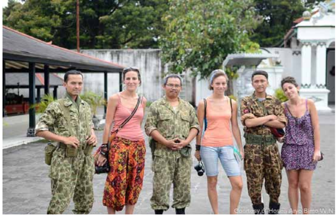
Figure 7. Reenactors' impression of KNIL Andjing NICA soldiersvisitingYogyakarta palace and taking picture with royal servants and tourists, 2015.