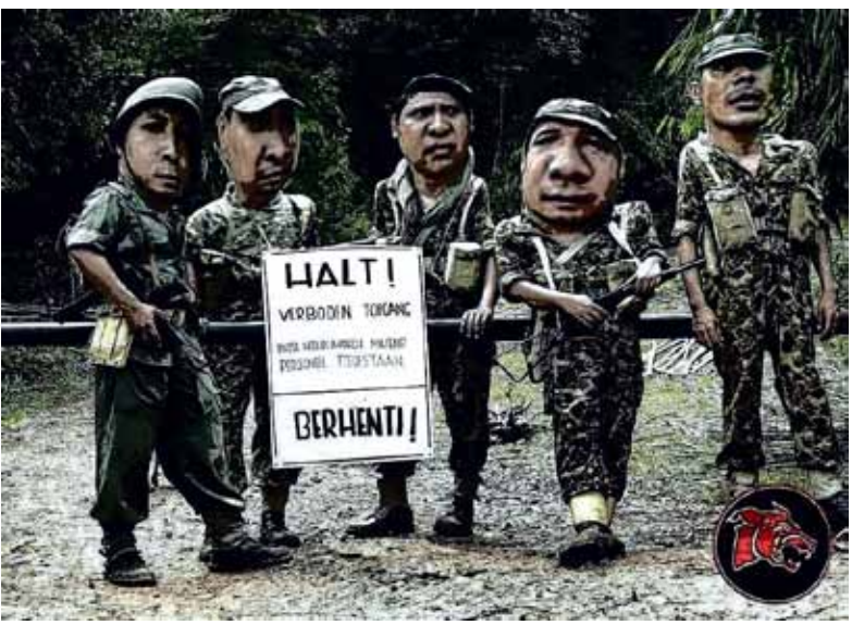
Figure 10. Mockery mimicryexpression over the visual characters of KNIL Andjing NICA's soldiers by a group of Historical van Bandoeng ina shooting session of the film Lasjkar Syetan, 2013.

The mimicry is carried out by creating a hybrid construct of figures oriented to making fun. KNIL soldiers now joking and ridiculous, no longer serious and scary. Reenactors, costume producers and the society reproduce new meanings adapted to the interest of self-actualization, military fashion, and spectacle in line with a contemporary point of view. On this site hegemonic power is produced since the reenactors, society, and producers' interest is controlled by capitalistic economic values. Reenactors become a part of the production process and at the same time a package of contemporary spectacle ending in one outlet, that is fashion industry.