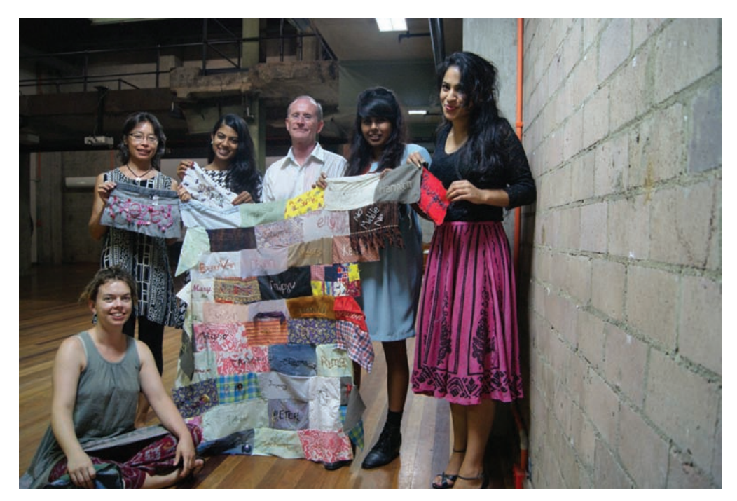
Figure 14. Late night participants on the final night of the Nee (born as) residency at Casula Powerhouse.