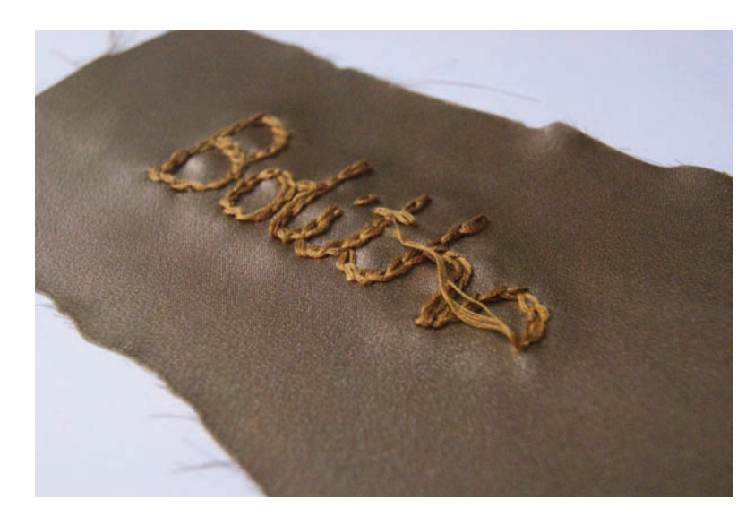
Figure 9. My husband's surname on fabric from the wedding dress I didn't wear.