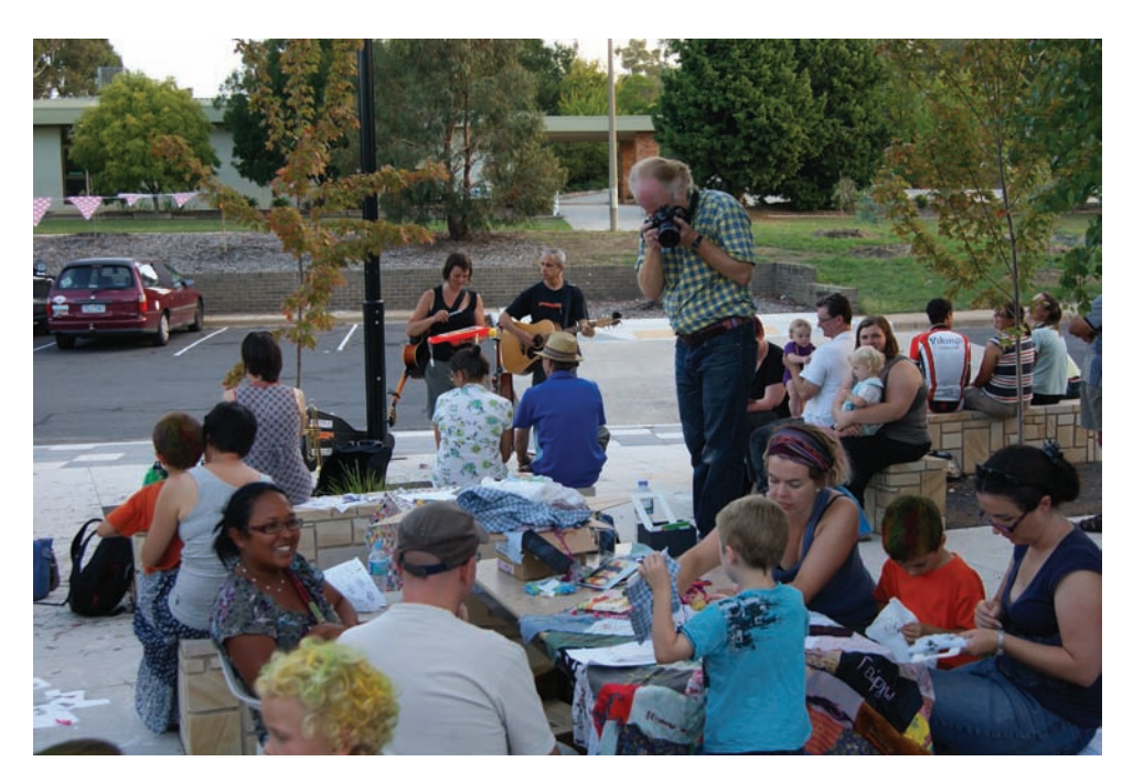
Figure 15. Nee (Born As) at the Scullin Shops Party, Canberra, March 2013

The last iteration of Nee (Born as) to date was at street party held in my neighbourhood to celebrate our city's 100<sup>th</sup> birthday. I was surrounded by my communities; mothers from my children's school sat down and told me the stories of the names they inherited from their ancestors, and the ones that were discarded in the rush to assimilate to their new home; my dear friends played songs about our town and its histories in the background; the local hairdresser dyed kids hair for free and I got to know the people of my place that little bit better. It is the freedom in this project that is its greatest asset, by which I mean that the project itself is free from me, and any of the other restrictions and negotiations that have limited other participatory projects I have worked on. It is a real conversation, both in its physical and meta-physical presence; it can happen anywhere, anytime; it can be formal and structured, part of the agenda of a larger institution; it can be loose and responsive, just as likely to turn to tragedy as to love.