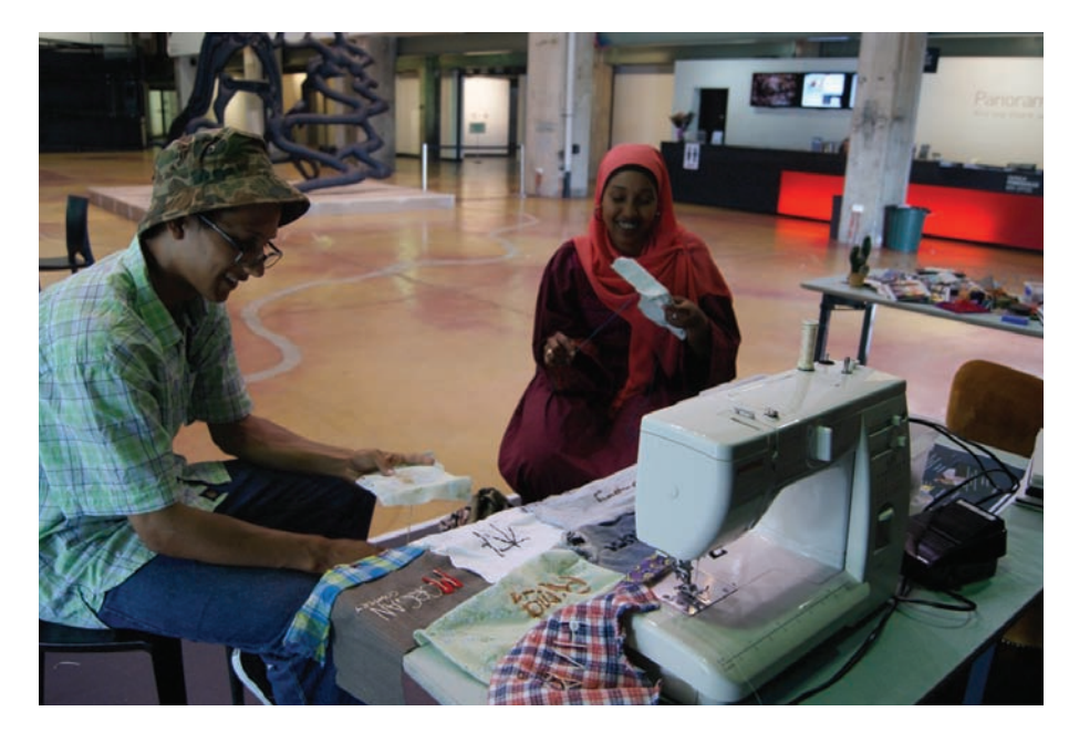
Figure 15. Née (born as) at 4A Centre for Contemporary Asian Art, during the In Memory of a Name symposium, 18 February 2012.

and difference, and the equally manifold ways in which we resist and reject these (sometimes) invisible strictures on our lives. These conversations revealed things about each other that could be shared by looking at each other's stitching: the experiences of humanity, passion and ambivalence, suffering and empowerment.