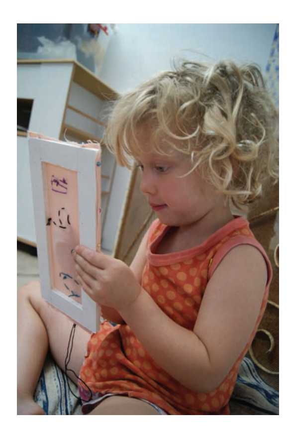
Figure 10. My daughter with her first ever attempt with needle and thread, during the first Née (born as), 26<sup>th</sup> January 2012