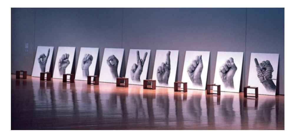
Figure 3. Voice Without Voice/Sign, 1993 – 4, Silkscreen on canvas (9 panels), wooden stools and stamps, 143.5 x 95.5 cm each panel, Fukuoka Asian Art Museum collection.

The familial background Harsono detailed for us was that of a Chinese Indonesian, with strong Javanese influences from grandparents and a formal Catholic education. In accordance with Chinese tradition, Harsono was given the name Oh Hong Bun at birth, a name drawn from his family's Hokkien lineage. In 1966, when Harsono was 18, a Cabinet decree "recommended" all Indonesian citizens of Chinese descent adopt an indigenous name. A set of historical, political and social factors – too complex to explore in depth here – influenced this decision, which in effect obliterated signifiers of otherness from Indonesian society (Dieleman.,Koning & Post, 2010). Harsono chose to use Franciscus Xavier, his baptismal names, and Harsono, a name he chose in consultation with an acquaintance.