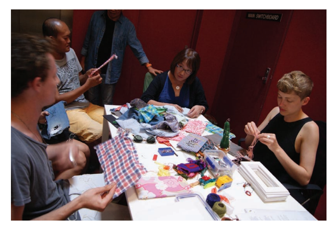
Figure 14. Née (born as) at 4A Centre for Contemporary Asian Art, during the In Memory of a Name symposium, 18 February 2012.

Name change may seem banal, but through the prism of names we expose a wide range of challenging discourses. Through our conversations about names we traced discrimination, power relations, gender stereotypes, domestic and social violence, the negotiation of identity, familial interaction and assimilation of the other.