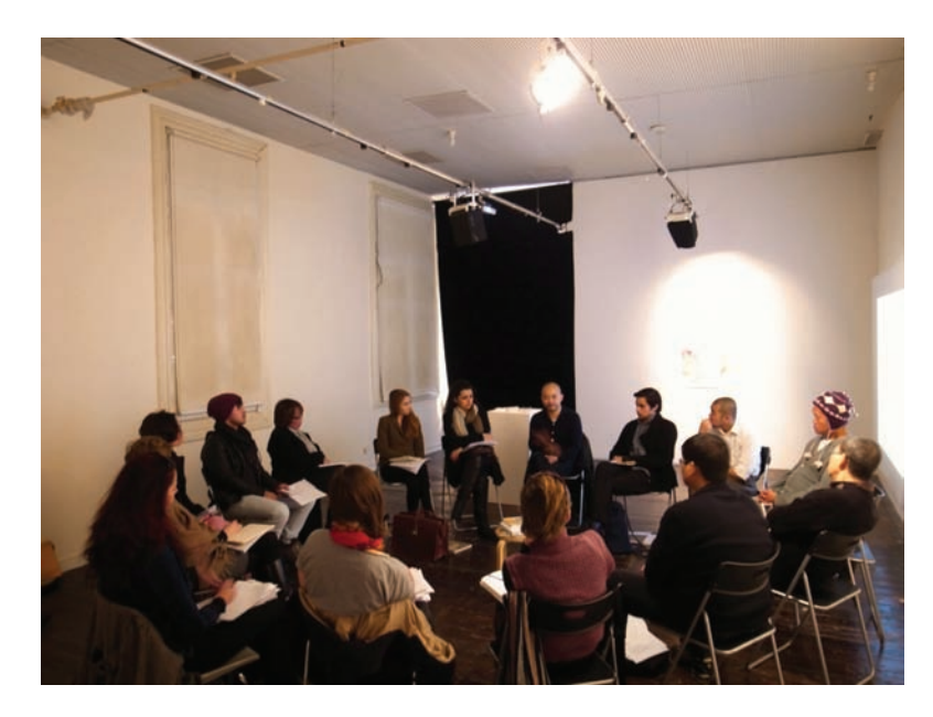
Figure 1. The first In Memory of a Name curatorium workshop at 4A Centre from Contemporary Asian Art, June 2011.

The etic position provides a counterpoint, and requires periods of concentration on the reading and writing of theory. In my methodolgy, field notes are a part of this analytical period, and are written soon after, but not during field activities. Writing requires a self-distancing from (art) activity, and this provides space for reflecting on the experience of being within the project. Reading provides context from social and art histories, theories, and discourses. It provides viewpoints for resistance and for admission.