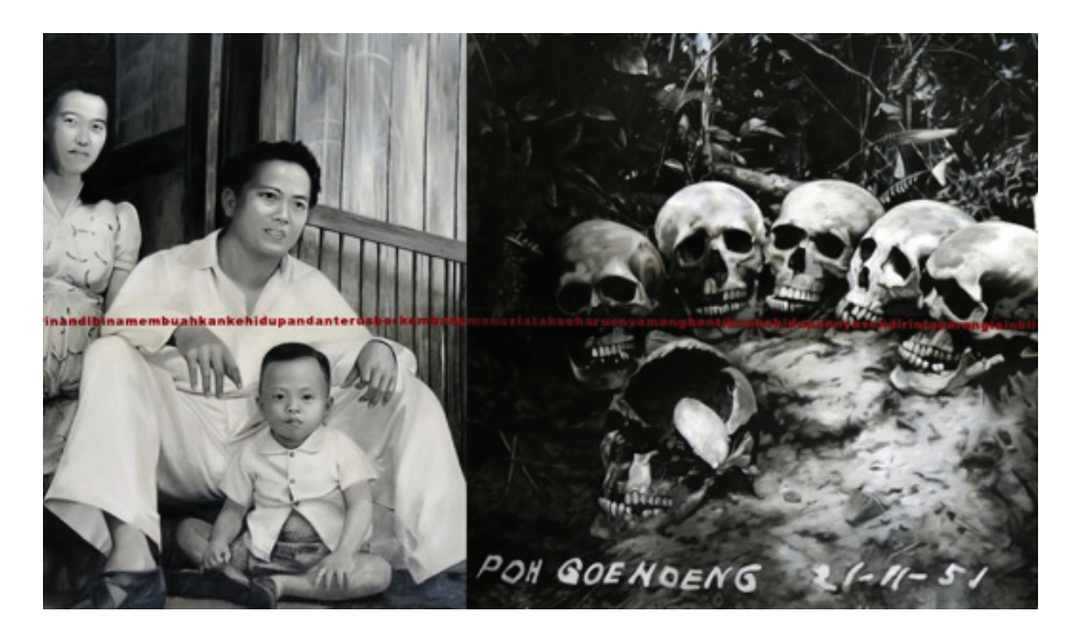
Figure 4. Preserving Life, Terminating Life #2, 2009, Diptych, acrylic and oil on canvas, thread, 200 x 350 cm, Artist's collection. The painting draws on images from Harsono's family photo album and his father's documentary photography.

economic growth through exploitation of natural and human resources, and consequently created an enormous majority of poverty-stricken citizens underneath small business elite. Harsono and his fellow artists stood up to expose what was known as KKN, or corruption, collusion and nepotism. Within Indonesia their work was often subtle enough to fly under the radar of officials, who at times prevented exhibitions that were deemed excessively political. Whilst artist Moelyono's exhibition to commemorate 100 days since the murder of labour rights activist Marsinah was banned, Harsono recalls an official visit to his Voice Without Voice/Sign (figure 3) installation. "I know a government spy came to the gallery to see the work, asking questions about the meaning, but I wasn't there, so I got lucky. The person in the gallery lied and told him he didn't know the meaning of the work" (Koleshikov-Jessop, 2010). After the fall of the New Order in 1998, many artists hit a creative vacuum.