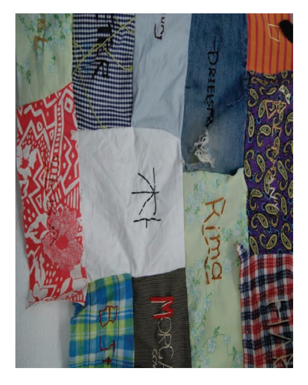
Figure 13. This participant used horizontal Korean script, challenging my aesthetic skills.

I conducted the first iteration of Nee in my garage/studio. Already participants began to affect the object and concept. They brought fabric a little too large or small, for my imagined bricks. Small children who couldn't write stitched abstract compositions. By the second iteration, at 4A Gallery one Saturday in February, I was learning how integral to the concept the flexibility of fabric was. I was reminded that not all script travels horizontally.