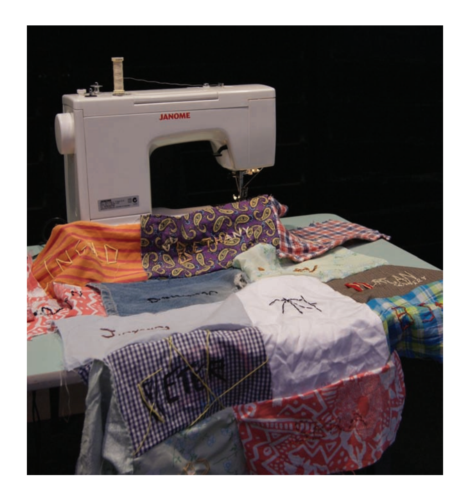
Figure 16. Stiching together the differents traces of stories about names; building a soft memorial to the lost and found