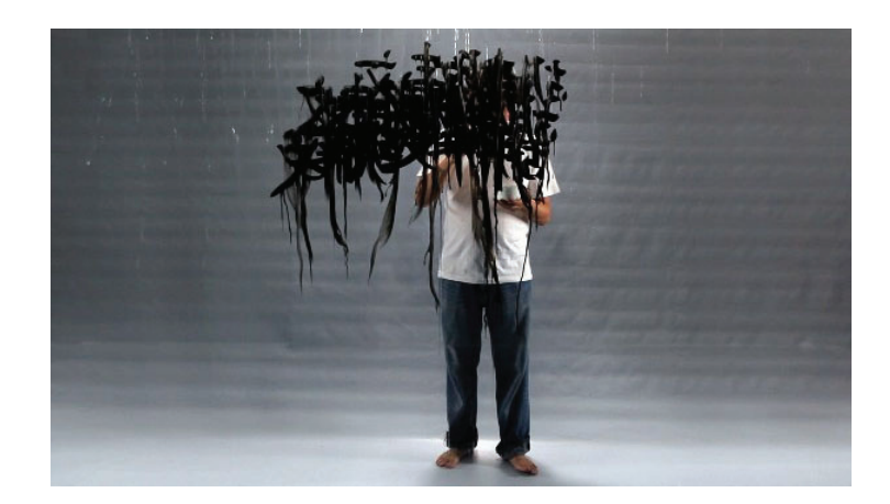
Figure 6. Writing in the Rain (2011), video performance exhibited in conjunction with works by the In Memory of a Name consortium, 4A Centre for Contemporart Asian Art

The background to Harsono's practice, and in particular this work, formed the jumping off point for our curatorium to explore the context of naming, name change, discrimination and power in the Australian context. After the contextual introductions, we began by talking about our own names. Where are our names from; what do they mean; how have they changed and why? What broader issues about name change can we identify from our own experiences?