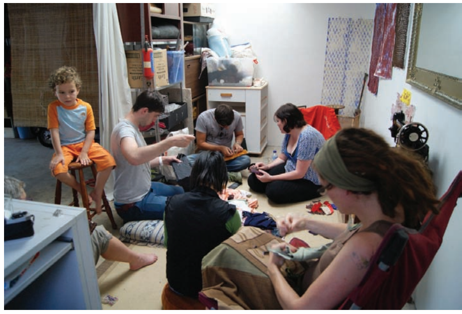
Figure 12. More neighbours, friends , family and colleagues conversing and stitching during Née (born as) in Canberra.

I conducted the first iteration of Nee in my garage/studio. Already participants began to affect the object and concept. They brought fabric a little too large or small, for my imagined bricks. Small children who couldn't write stitched abstract compositions. By the second iteration, at 4A Gallery one Saturday in February, I was learning how integral to the concept the flexibility of fabric was. I was reminded that not all script travels horizontally.