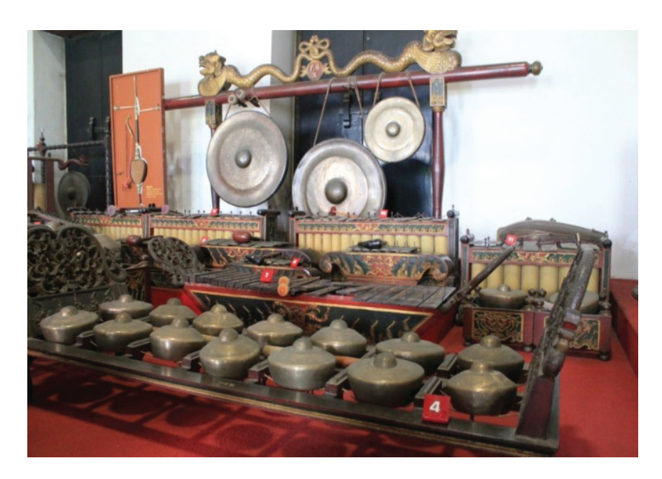
Figure 2. A set of first gamelan in Thailand from P.B. X Surakarta at the Pra Nakhon National Museum, Bangkok.

Thai people are still playing the old songs from Indonesia, using angklung and gamelan, as well as with traditional Thai music ensemble. For example, the song 'Burung Kakaktua' played in the musical traditions of phiphat, while the song 'Hom Rong Shawa' or 'Yawa' (Java) which included the song 'Busensok' (Buitenzorg), 'Yawa', 'Kerath Raya', 'Semarang', 'Bukan Tumo', and 'Kediri' which is played with the angklung.