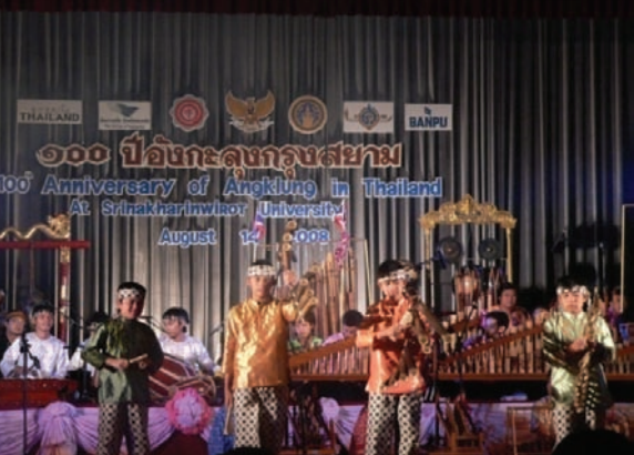
Figure 3 and 4. Photos 3-4, the Centenary Anniversary of Indonesian Angklung to Thailand, 2008 at Srinakharinwirot University and Ministry of Foreign Affairs of Thailand.

In 2008, there was a grand celebration at Bangkok, Thailand, to mark the 100<sup>th</sup> anniversary of the introduction of angklung to Thailand that organized by both the Thai and Indonesian governments included Ministry of Foreign Affairs Republic of Indonesia and Kingdom of Thailand, the Embassy of Republic of Indonesia, Bangkok,