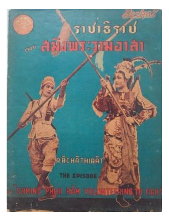
Program note of Lakorn Pan Tang "Rājādhirāt": Sming Pra Ram A Sa, Fine Arts Department, 1952