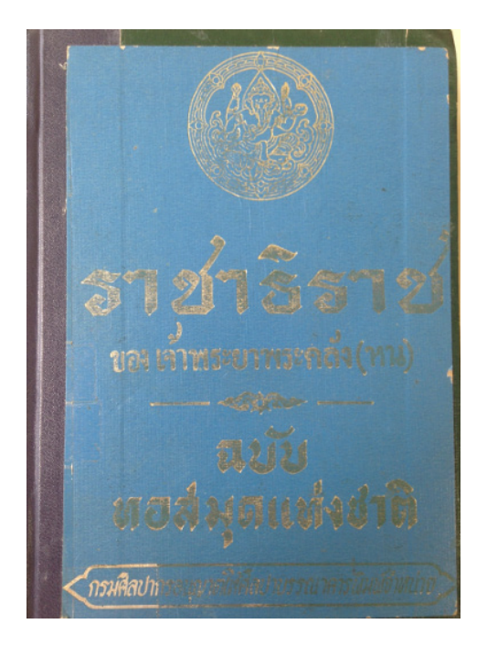
Rājādhirāt Literature by Chao Phraya Phra Khlang (Hon), Fine Arts Department, 1969