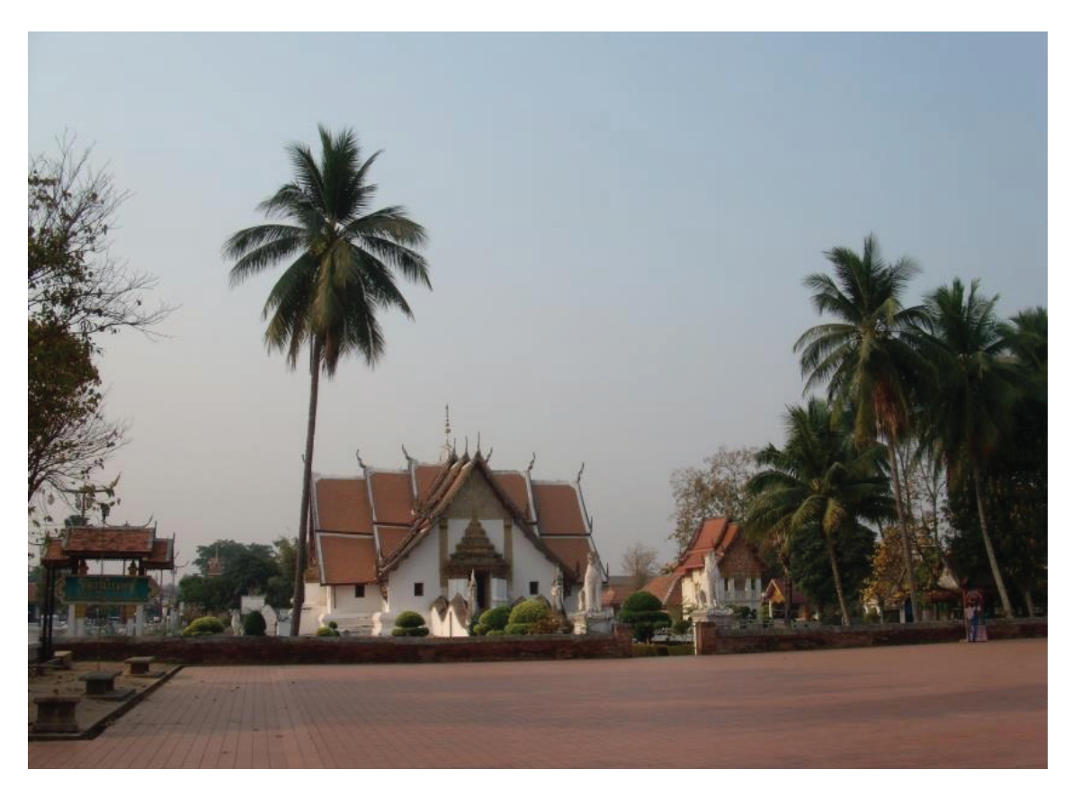
Figure1. Wat Phumin, Nan province

The conclusion from in-depth interview from tourists, we can conclude that the tourists' personal experiences came to be important role in order to develop proper solutions to facilitate tourists to obtain information from Lanna mural paintings at Wat Phumin, Nan province for this study.