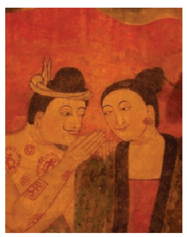
Figure 2. 'Poo Marn Yar Marn' ('Whispering of Love')