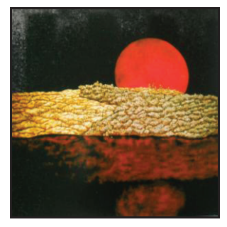
Nasrul Palapa "Pancang Emas di Batas Cakrawala II", 145 x 145 cm, mix media