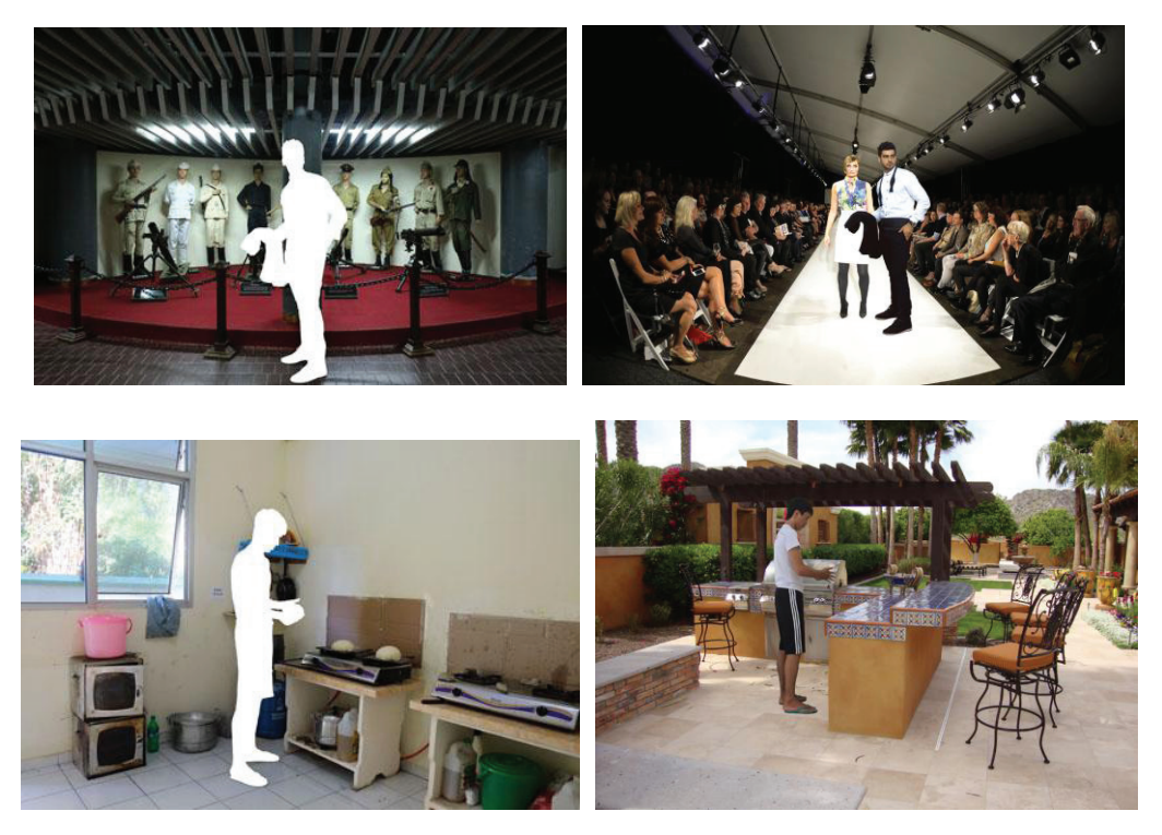
Fig. 1. Some of the works in the series 'Alhamdulillah We Made It'. The left picture is taken in Yogyakarta, the right photo is cultivated with a catwalk 'location' in Australia.

The advancement of information technology, especially the internet, greatly helps artists in finding the necessary information to strengthen the foundations of the concept of creation. The process of extracting information done through the internet lead them to find the appropriate stakeholders. In the case of this work, MES 56 traced information about organizations dealing with refugees. Based on these search results, MES 56 then studied and visited JRS under the International Organization of Migration (IOM). JRS was headquartered in Yogyakarta. "We came to JRS to seek further refugee issues, and we view JRS as a relevant institution. To find out the refugee problem, we are given a one day workshop, in order to understand the refugee problem, and so what we do in the refugee place do not become a new problem."