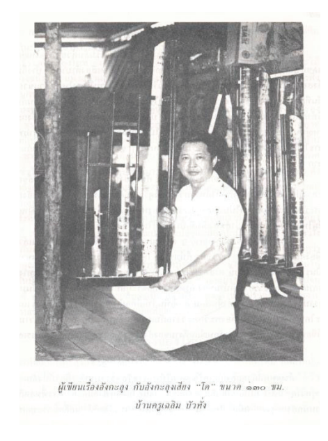
Writer with Thai Angklung 150 cm high

According to the large size bamboo Angklung instruments, it should be stated that Thailand never own the big bamboo idiophone which is bigger than the ranad thum xylophone we commonly used in the pipat ensemble. We are not lucky to own such a large size bamboo for making musical instruments like the country of Indonesia.