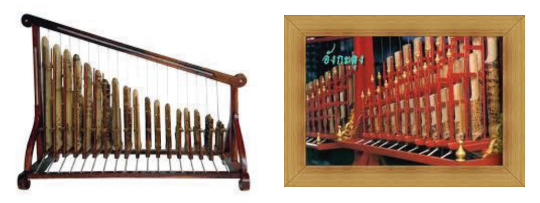
Setting of 18 hanging Angklung for one player

At present, the Thai Angklung are made in the medium size home factory founded in middle Thailand and they made a large frame of 10-18 hanging Angklung frames that is able to play by one man alone.