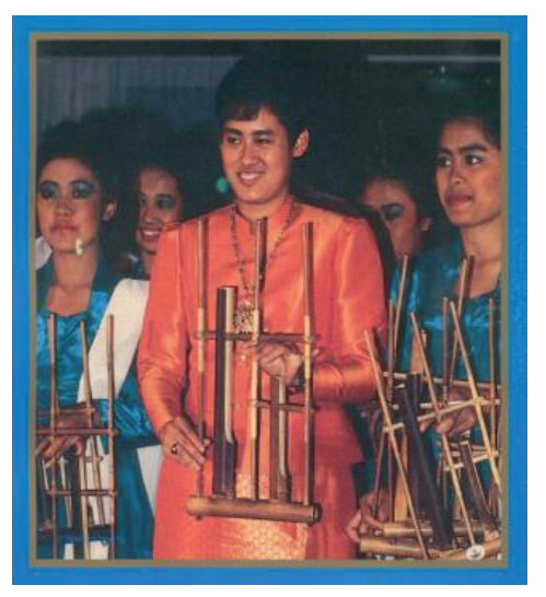
HRH Princess Sirindhorn used 2 tubes Javanese Angklung, 1984

Before the second world war, Thai Angklung were very well used in local school children as music in classroom. This was quite good for unity practicing of group music and as well as its price was not that high. A Thai Angklung set of 10 to 14 frames cost only 200-300 Baht. Today, music education in school class for outdoor were very common with the larger Angklung ensembles. Sometime they used over 100 students.