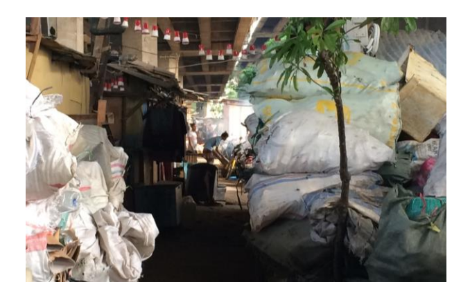
Figure 1. Kampung Air Baja Village, Penjaringan, North Jakarta.

For the TTG project, DKJ invited RajutKejut to collaborate with the Air Baja village residents, among other artists. RajutKejut is a knitting community in Jakarta. It has been doing the yarn bombing activities since 2014. In the project, RajutKejut collaborates with the residents to explore life from a different perspective - Art Activism. The project's spirit provides residents with art, leading to joyful, happy, independent lives with dignity. Art encourages the passion of life. The program starts with RajutKejut yarnbombing the urban village and the forests located next to it with colorful knits.