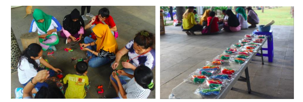
Figure 3. RajutKejut mentors with the participants.

The mentors initially offer a necklace design in a photograph, with a tapestry technique in natural color shades. The participants do not seem enthusiastic about this offer because it seems complicated, and the colors in the design; examples are not attractive to them, so this model cannot be executed. The mentors then offer another example of a necklace design with a tassel technique in bright shades, worn by a woman in a contemporary style. The participants are excited because they think it is not difficult to make, and the necklace comes in vibrant colors, so it is more attractive. The right reference has an important position in making a decision. This is in line with Hume's explanation of taste, that beauty is no quality in things themselves: It exists merely in the mind that contemplates them; each mind perceives a different beauty. Beauty and worth are merely relative and consist of an agreeable sentiment, produced by an object in a particular mind, according to that mind's peculiar structure and constitution (Stradella, 2012). The participants usually spend their spare time watching soap operas on television. The consumption of drinks and snacks sold in the stalls around the residence is a daily snack for their children. All of these objects become their visual reference.