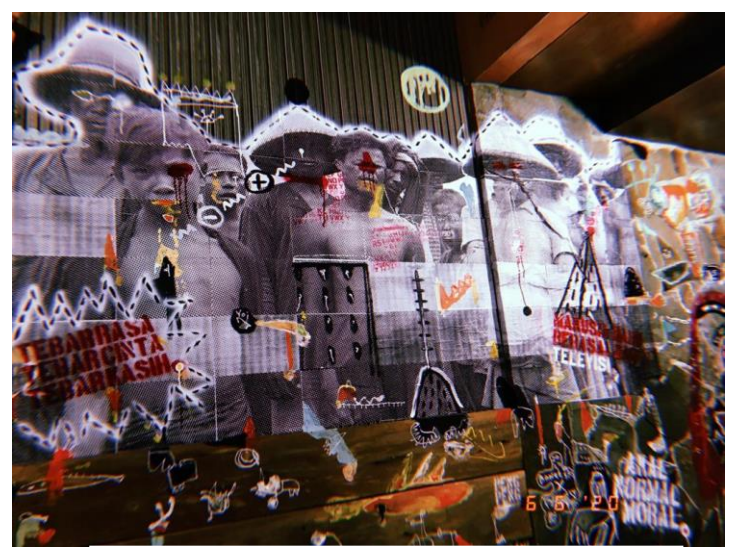
Figure 4. Edi and PengPeng Artwork (2)