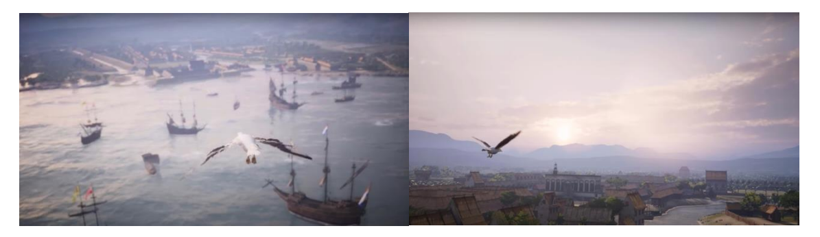
Figure 2. Trailer of Batavia 1627 VR

The last approach, the aesthetics, are shown by the sense of 3D realistic visualization. The 3D environment is developed to resemble estimates of original conditions in the past—the interpretation based on visual references and the ruins of historical buildings. As a result, most of the projects present the condition of immersion. The users feel that they inside the virtual archaeological building. On the other hand, the Batavia 1627 project given the sensation of flying due to the camera perspective of bird eyes (as shown in Figure 2.). Despite the visual sensation that the user felt, there is also historical information about the archaeological site in the 2D text user interface.