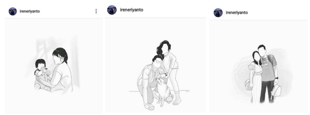
Figure 2. Custom illustration from Ilustrasi Donasi art initiative

first batch to receive orders for ten illustrations. She illustrates by giving outlines of the figures from the photographs and leaving the faces blank. This visual style presents quite an interesting approach that can be related to the concept of donation and anonymity. The artworks for illustrasi donasi can be seen here in Figure 2.