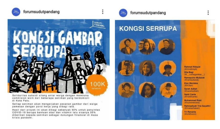
Figure 5. The second Batch of Ilustrasi Donasi was announced in July 2021

Palu, they initiated a The Kongsi Gambar Serrupa as way to contribute in helping those affected by the situation. There are nine artists involved and almsgiver can commission an artwork, drawing or illustrations based on their requested image or photographs, as shown in Figure 5. The proceeds from the Gambar Kongsi Serrupa project is then used for cross-subsidies where 50% of the income is donated to aid medicine and vitamins for Covid-19 survivors and the other 50% is given to artists as a financial support during the pandemic.