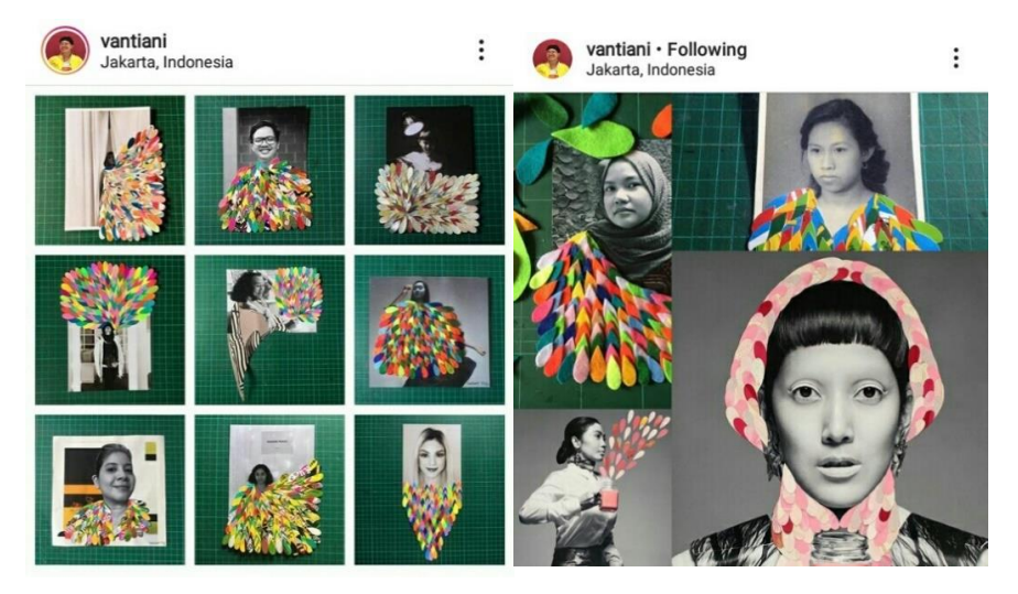
Figure 1. Custom made collage artwork from Puan Bantu Puan art initiative

In the Puan Bantu Puan project, almsgiver can contribute by ordering Ika's collage artwork, tailor-made for each individual. People can send prints of their chosen photographs to then be turned into handmade and customized collage artwork, as shown in Figure 1. There were a total of four batches of the Puan Bantu Puan art donation project, stretching from March to November 2020, with each batch limited to a total of five collage pieces due to the fact that it is a custom handmade artwork that requires a lot of time and craftsmanship to produce. The Puan Bantu Puan project donated 85% of each artwork to Sanggar Seroja, a creative space for transgender communities and groups to channel their artistic talents, located in Kampung Duri, Jakarta, formed in 2016 (Irham, 2018) and also to several other transgender communities in Yogyakarta.