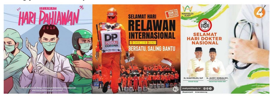
Figure 5. Depiction of appreciation towards frontline worker's theme

During the pandemic, with the government suggesting that the public limit their outdoor activity and mobility, delivery service workers play a significant role to help the public fulfilling their daily necessities. Unlike health workers, especially doctors that can be categorized within the upper-class group in society in terms of their income, delivery service workers primarily consisted of the lower-class workers. Showing appreciation toward delivery service workers can convey the idea of the candidate's inclusiveness toward the lower-class group of society which is a big part of the society.