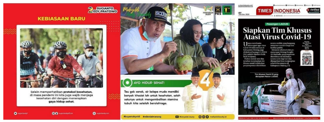
Figure 4. Depiction of promoting workouts, healthier food, and arranging Covid-19 taskforce visual codes

Conducting a political campaign during the pandemic becomes a challenge in itself. Some candidates utilize visual elements to illustrate how they conducted their campaign activity during the pandemic to assure the public that they conducted their campaign activities appropriately considering situations caused by the Covid-19 pandemic. This explanation becomes vital to answer the questions regarding the safety of campaign activity held by the candidate and whether candidates implement many things they suggested to the public. This explanation can be conveyed by depicting the candidate implementing Covid-19 safety protocols and conducting his campaign activity with a virtual meeting.