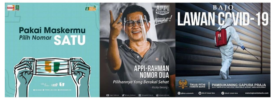
Figure 2. Depiction of Covid-19 safety equipment sub-themes: mask, face shield, and PPE

Covid-19 pandemic resulted in wearing a mask as a new norm in daily life during the pandemic. Therefore, depicting masks within election campaign media became a relatively more straightforward attempt to associate candidates to the Covid-19 pandemic and the public. Some campaign media depicted the candidate or others wearing a mask, candidates helping others to wear a mask, candidates giving a mask to other people, or only portraying a mask in election candidate's campaign media. It needs to be noted that, although face mask became one of the most visible Covid-19 related visual imageries in election campaign media, however, there are campaign media that depicting election candidates did not wear it properly. Some campaign media depict candidates carrying the mask in their hand while doing campaign activity in the public and wearing a mask under their chin that does not cover their mouth and nose.