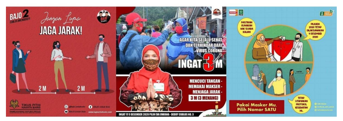
Figure 3. Depiction of physical distancing, temperature check, and washing hands visual codes

Apart from safety equipment sub-theme as Covid-19 related visual code in election campaign media, the theme of promoting Covid-19 safety protocols also included advising physical distancing protocol. Physical distancing protocol in election campaign media was shown by advising people to stand apart and depicting campaign activity where the participants stand or sit apart from each other with measured distance. Along with wearing a mask, during the pandemic, the public is advised to distance him/herself from other people when they are in the public space to minimize the risk of Covid-19 virus transmission (Pratomo, 2020; Dewi & Probandari, 2021). Similar to the case of wearing a mask, reading on the material found that there are candidates that depicted themselves in their campaign media breaking physical distancing protocol especially when they are conducting their campaign activity in the public.