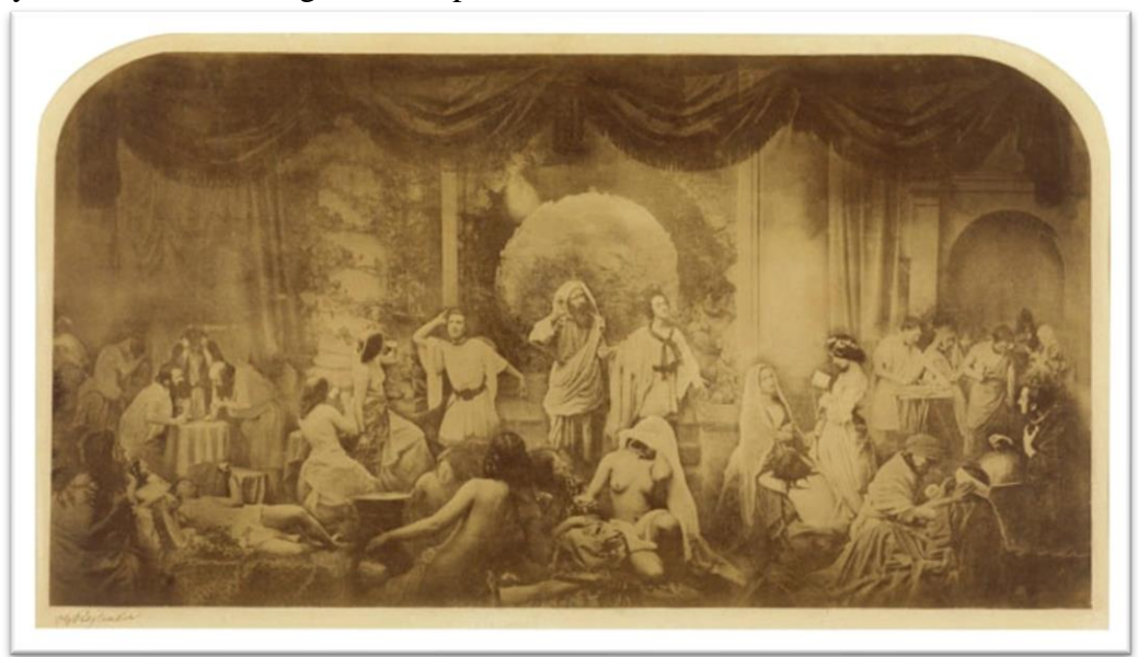
Figure 1. Oscar G. Rejlander needed more than 32 negatives for creating 'The Two Ways of Life.' Oscar G. Rejlander, Two Ways of Life (Hope in Repentance), 1857. Albumen silver print, 21.8 x 40.8 cm, Moderna Museet, Stockholm

mesmerizing surealistic photograph. It is unimaginable how careful and precise they were when working on those pieces.