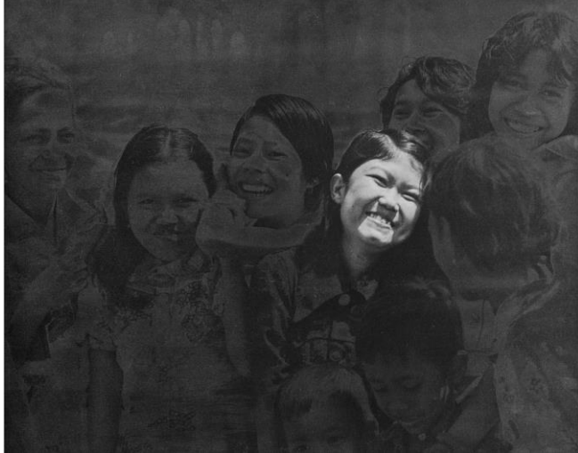
Figure 8. Tjan Hwa Tjoe, Senyum Remaja , Surabaya. Manipulation darkroom technique.

Digital technology triggered the creation of visual artworks resulted from image combinations. Budi Yuwono, a digital imaging artist, says that by combining some images using digital imaging means producing 'new realities.' He further asserts that the new realities are the visualized objects or events that did not exist