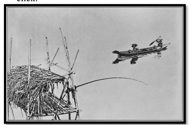
Figure 3. Dharma Suryanto, Fishermen , Gombong. Manipulation darkroom technique.

Before the digital replaced the analog, artistic effects were created through many techniques such as multi-printing, solarization, bast relief, film sandwich, and other manipulation darkroom techniques. The skill in printing manually in the dark room was prestigious in the past. However, these days this special skill has been taken over by Photoshop software that c an be operated by anybody only in one click.