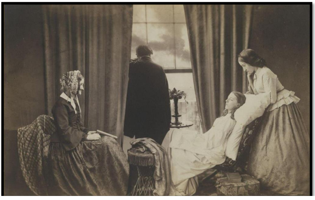
Figure 2. Henry Peach Robinson conjoined five negative glass plates for creating 'Fading Away.' Henry Peach Robinson, Fading Away , 1858. Albumen silver print from glass negatives, 23.8 x 37.2 cm. The Royal Photographic Society at the National Media Museum, Bradford, United Kingdom