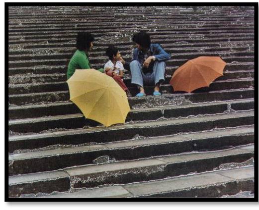
Figure 4. Santoso Alimin, A Happy Family , Surabaya. Manipulation darkroom technique.