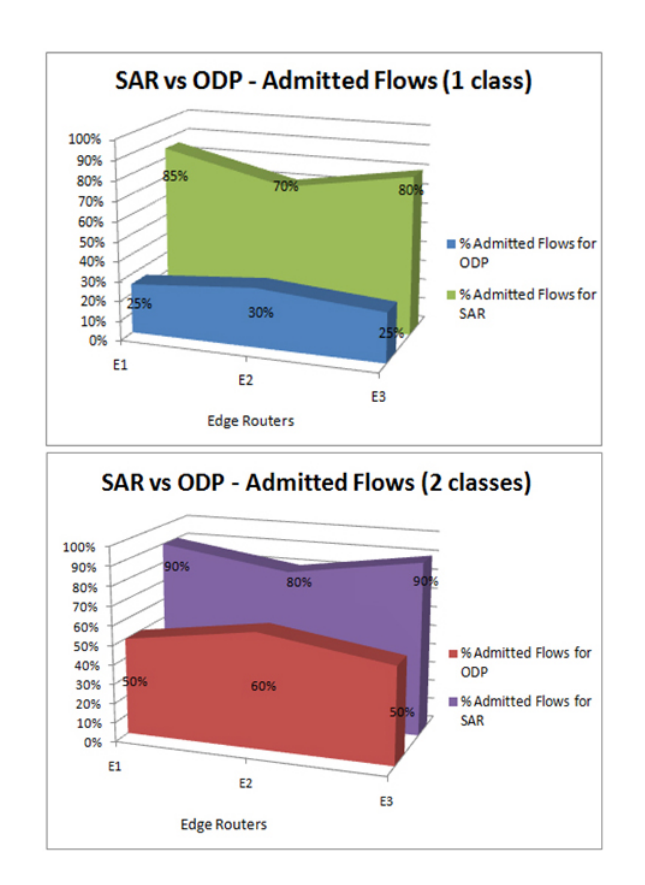
Figure 5: Test Results - Admitted Flows

admitted for SAR framework is higher than in the case of ODP framework, on both tested traffic patterns, which demonstrates a more efficient use of network resources. Also, the equal number of control messages transmitted by the two frameworks shows that SAR is a scalable framework. Finally, tests confirmed that admission control has eliminated network congestion.