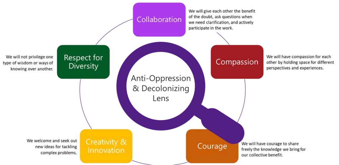
Appendix Figure 1: SPECTRUM’s Mission and Values