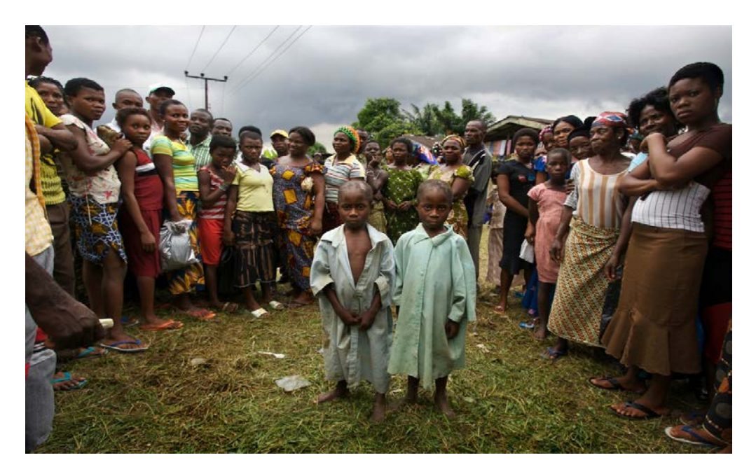
Figure 1: Children accused of practicing witchcraft.

There were some words and phrases denoting physical harm , including "burned", "beaten", "bathed in acid", and "killed". Example of words and phrases utilized in coding structural harm include "abandoned", "stigmatized", "emotional injury", and "emotional and psychological torture of children". Examples of comments used in coding structural harm include "unidentified [persons] ransacked the CRARN centre in the night, ostensibly in the search for Mr. Ikpe-Itauma, leaving the young children traumatized" (Sahara Reporters, 2010c, para. 9); and further, "the Ministry was also ignorant of the activities of NGOs in the state which took up the challenge of providing for the children who were stigmatized, and who found themselves abandoned and neglected by the government and society" (Sahara Reporters, 2011a, para. 5).