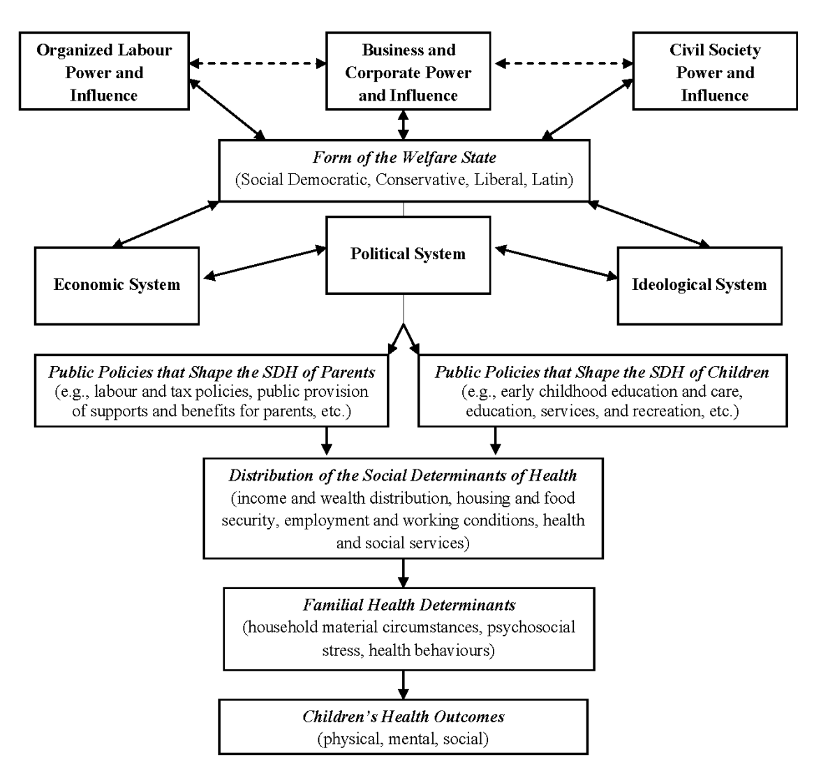
Figure 1: Depiction of Pathways by which the Key Concepts of a Political Economy Approach Explain Children's Health Outcomes both within and across Jurisdictions