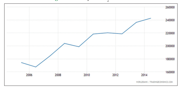
Figure 2: Malaysia CO, emission