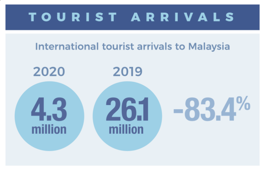
Figure 3. International tourist arrival patterns in COVID-19 pandemic outbreak (Malaysia, 2022)

In 2020 (see Figure 3.), the overall tourism industry was hardly affected by the COVID-19 pandemic, with an estimated decline to -83.4% of total global tourists arriving in Malaysia from previous 2019 (Malaysia, 2022). These are the significant challenges faced by Malaysians to increase the tourism industry in the next few years of Post-Pandemic. In order to increase this, Malaysians can enhance halal tourism promotion through the strategic transformation. Based on the Tourism Malaysia Strategic Planning 2022-2026, there are four strategies to do: 1) promotion domestically, 2) promotion internationally, 3) communication which integrates public relations and corporate communication, and 4) communication which covers information digital and advertising.