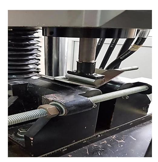
Figure 10: Bending test machine