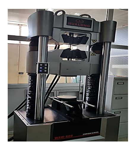
Figure 5: Tensile test machine