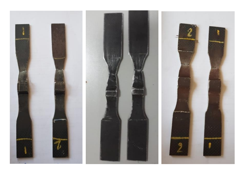
Figure 3: Tensile test samples (weld metal)