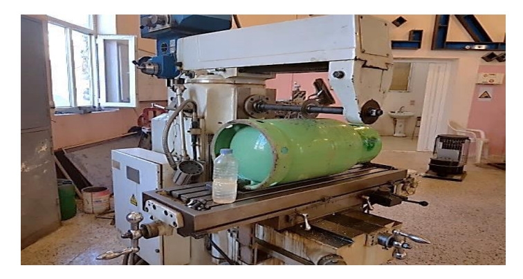
Figure 6: Cutting process of LPG cylinders

The preparation of hardness test samples has carried out with an appropriate cutting method, which involves selecting the correct cutting tool with using a cooling liquid to avoid the samples from burning and distortion. To cut and prepare the specimens for the hardness exam, a milling machine process with cooling liquid was used as shown in Figure 6. After cutting, the samples were grinded and polished in order to prevent any scratches and to accomplish right reading. The Vickers hardness testing was carried out for different locations of the sample face, as shown in Figure 7, to check the consistency and uniformity of the properties. The micro-hardness testing was carried out as per ASTM A384 [13]. Diamond indenter (pyramid) with face angle of 136° was used. During testing (1kg) load was applied on sample with dwell time of 15 seconds, and both the diagonals of pyramid indenter (d1 and d2) were measured with microscope at a magnification of 500X. The results of the hardness tests have shown in the Table 6. The average hardness results revealed that the values of (sample D) offered the highest value as compared to other samples while sample (C) shows the lower result as compared to others.