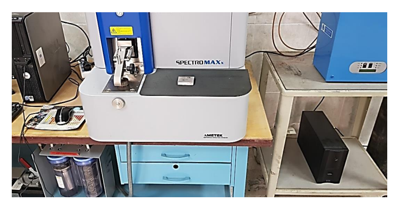
Figure 2: chemical composition of samples