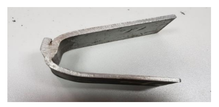
Figure 9: Bending test sample