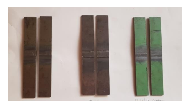
Figure 8: Prepared bending test samples

Bending test is a one of an important test that standard required to achieve. This test achieved perpendicular to the weld zone which has been bent through angle180°. Bending tests for ductility provide a simple way to evaluate the quality of materials by their ability to resist cracking or other surface irregularities during one continuous bend condition. The bending tests were carried out in accordance with AWS standard [14] for all three LPG cylinders to evaluate their welding qualities. The results of such a test obtained by the same tensile machine, the bending test samples and machine has shown in Figures 8, 9, and 10. The bending test results showed that the samples were bent at 180 degrees without breaking or cracking in the samples. This means that the samples met the requirements of the standards. The ductility of weld was satisfactory and there are no defects in the welding joints for all samples.