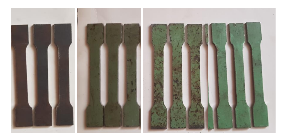
Figure 4: Tensile test samples (base metal)