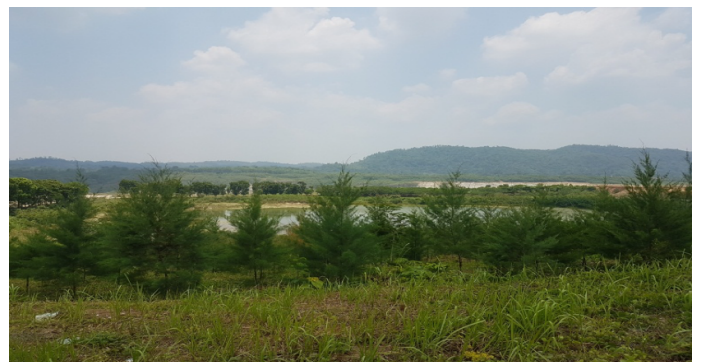
Figure 6. Evergreen Plants in zone revegetasi

to restore and restore land quality, especially those related to prevention of land erosion quality of waters and rivers, pollution of heavy metals. Reclamation activities carried out by means of revegetation by planting a cover crop in the area that has been rehabilitated are interspersed with greening of grasses of elephant grass.