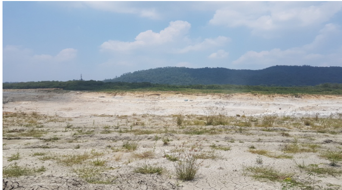
Figure 3. Condition of vegetation in the area of research