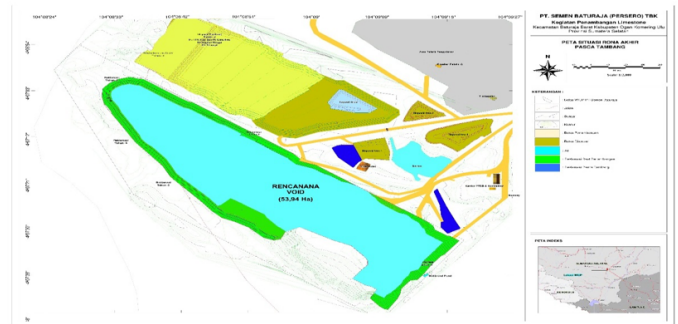
Figure 5. Land Allocation Plan (Rona End Mine) Mining of PT Semen Baturaja limestone (Persero) Tbk