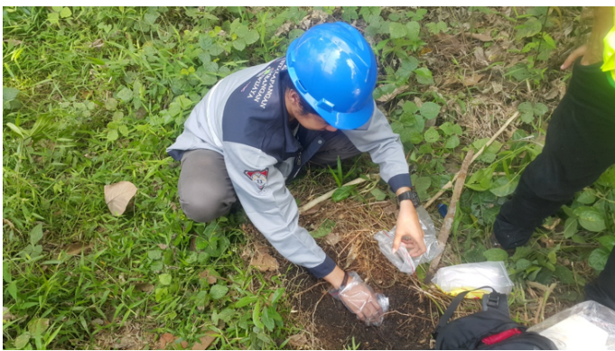
Figure 8. Sampling the soil initial hue

samples is almost close together, in the soil sample the Ph content is 6.2 whereas in the soil sample the initial pH content is 5.2. In the texture of 3 fractions including sand, dust, clay on soil samples of texture deposits 3 sand fractions: 41, dust: 18, clay: 42 whereas in soil samples the initial hue of texture 3 fractions cannot be analyzed because the initial ronol soil sample content >5% .