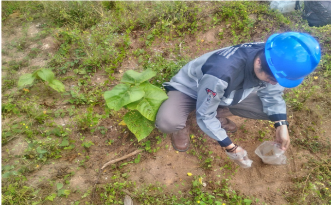
Figure 7. Sampling soil pile on zone revegetasi