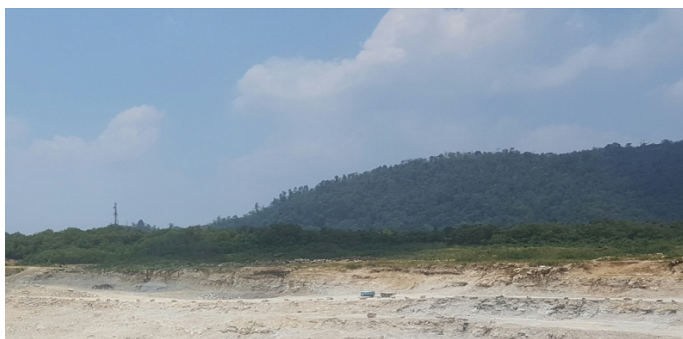
Figure 4. The vegetation mix of shrubs and trees had the small-medium