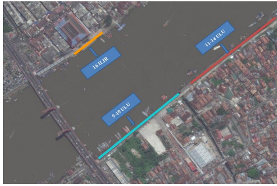
Figure 1. Study area

data which was obtained from the questionnaire results through the agencies related to the construction of the sheet pile in Musi River in Palembang. This questionnaires were given to 6 (six) related agencies, such as BBWS Sumatera VIII, Public Works Department of Palembang City, Public Works Department of South Sumatera Province, BAPEDA of Palembang City, Transportation Department of Palembang, Transportation Department of South Sumatera.