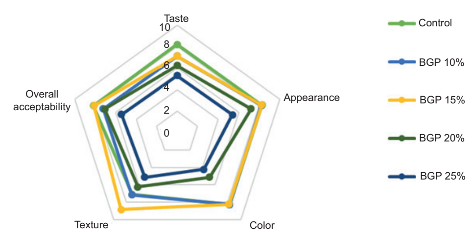
Figure 3. Effect of fat replacement by bottle gourd flour (BGF) on the sensorial quality of biscuits. Control represents biscuits without fat mimetic.

helps to lubricate and soften the structure of food and contributes desirable textural properties (Hasmadi et al. , 2014). Moreover, in the study conducted by Serin and Sayar (2017), maltodextrin and polydextrose were used as a fat replacer in biscuits which also resulted in increased hardness with the level of fat replacement.