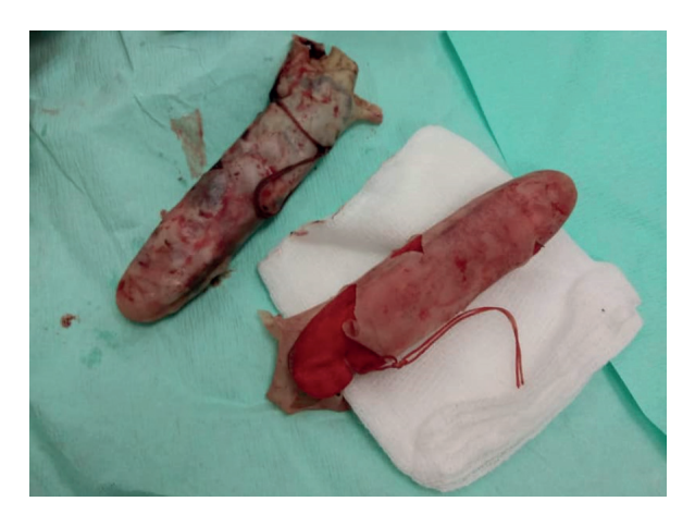
Figure 2:Nasal packs, enveloped with an outer layer using glove, after removal from the stomach.