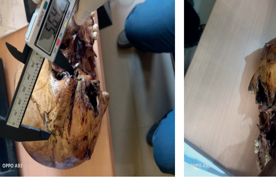
Figure 1: Measurements on the dry skull- AMP: Mastoid crest (left); ASC: supramastoid crest on right side of posterolateral surface of skull (right).

AMP: Asterion to tip of mastoid process; ASC: Asterion to supramastoidcrest; P value reached from Student's t-test, S=significant.