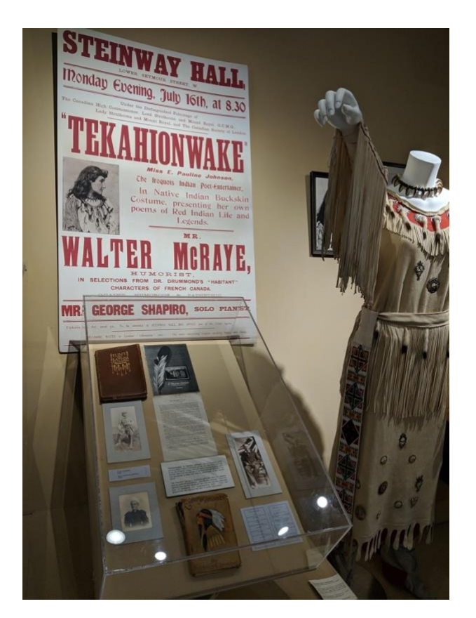
Figure 4: Display of archival and museum material at WCC, 2018.