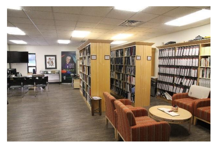
Figure 2: Visitor seating area in the SRSC. Photograph by Krista McCracken on behalf of the SRSC, 2015.

Given the potentially triggering nature of the records held by the SRSC, the Centre also works closely with the Ontario Indian Residential Schools Support Services to facilitate access to trained mental health and cultural support workers to visitors of the archives. In virtual spaces, the SRSC also provides warnings about the potential triggering nature of Residential School archival material and provides links to a 24-hour mental health support hotline for Survivors and their families. The SRSC's effort to support those engaged in research with Residential School records is not perfect and staff are currently looking at ways to improve on-site resources. In 2019, staff participated in basic first aid and CPR training, mental health first aid training, and suicide safe talk training. This ongoing professional development is part of a commitment to providing support to those looking at records of trauma. Future plans for the support of this work also include the