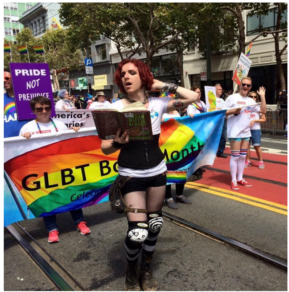
Figure 2. A banner promoting GLBT Book Month and a fabulous librarian/reader participating in the 45th annual San Francisco Gay Pride parade, June 28, 2015.

These highlights, based on numerous recent events and related efforts across diverse realms, serve as new and important access points and pathways to focus on and guide more equity-based and unifying thoughts and actions. Their meanings and reflections are powerful. They open up possibilities and represent important intersectional aspects of our collective history providing stepping stones and scaffolding for increasing motivation and more positive actions moving forward. They are also reflected in our lexicon and language-in seeing the shift from terms like safe spaces to brave spaces; less focus on allyship and more emphasis on #ownvoices; increasing concern with microaggressions, and, as Reese so astutely describes, the ongoing need for maintaining some limitations. (Arao & Clemens, 2013; Writing the Other, 2016). Each of the areas above, their impacts, as well as additional and emerging examples, may be considered in tandem with initiatives such as the Stonewall Book and other Awards-such as Lambda Literacy and more, (2021) and/or within the enduring and broader landscape of LGBTQIA+ library work (e.g., GLSEN, 2021; Libraries and the LGBTQ Community, 2021). All are deserving of additional consideration, which lies beyond the scope of this article.