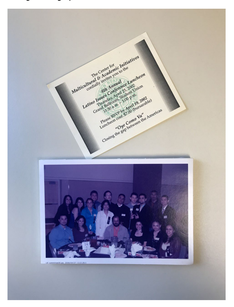
Figure 1 Vintage Photograph and Ticket

For example, we found the photograph in Figure 1 of the LIC from 2006, of the LIC committee, depicted here with an invitation for the 8<sup>th</sup> Annual Conference, with no context, and we struggled to identify every member in the photograph.