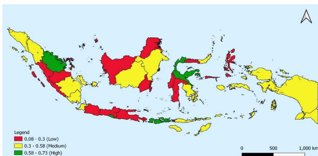
Figure 1. Distribution of The Macro Component of NZI in 2018

According to the calculation of NZI conducted by BAZNAS, the average index of all provinces in Indonesia shows that the performance and development of Zakat in Indonesia are quite good (BAZNAS Center of Strategic Studies, 2016). The score is 0.55, which is still in the middle and needs more effort to reach the stage where the zakat impact is excellent. However, the micro dimension of NZI is better as the score is 0.67, categorised as good. So, the factor that may inhibit the impact of Zakat lies in the macro aspect, which covers the institutional support from the regulation, State budget, and the database in the zakat institutions. Considering Indonesia is the biggest Muslim country in the world, the government should pay more attention to this by improving the regulation that supports the implementation of Zakat and increasing the budget to support the operation of zakat institutions.