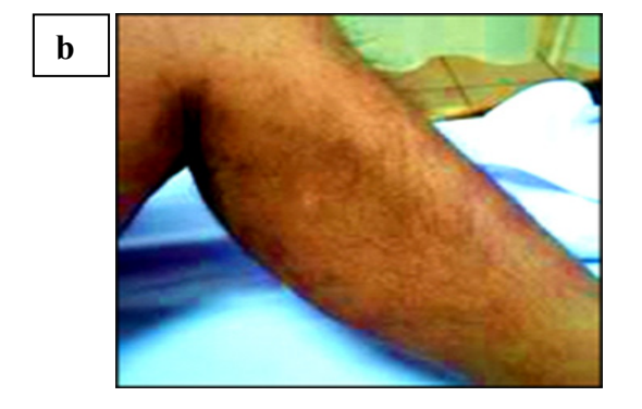
Fig. 1 Clinical Inspection Reveals Symmetrical Atrophies on Both Hands and Legs. Muscle Atrophy at Right Hand (a); Muscle Atrophy at Left Leg (b); Muscle Atrophy at Right Leg (c)