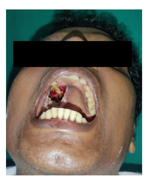
Fig 1. Palatal Perforation

A total of 59 cases were enrolled in the study, mostly referred from peripheral hospitals. Most of the patients were males (67.8%), and the majority of patients belonged to the age group of 45-60 years. All of them were detected to be COVID-19 positive either during the admission or were previously infected within the past 2 months. About 59.3% had received the first dose of vaccination before the infection and one had received two doses of vaccination. Almost all the patients were diabetics, of which 45.8 % had the disease for more than 10 years while six were recently detected as diabetics and were not on any medications. One patient with type 1 diabetes was on insulin for the last 30 years. Hypertension was the most common coexisting disease (18.6%), followed by chronic kidney disease (16.9%) and coronary artery disease (8.5%). One patient had undergone renal transplant 10 years back for diabetic kidney disease. Most patients presented within an average