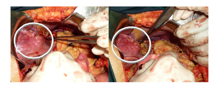
Figure 1. Hepatocellular carcinoma nodules on segmen 1 found intraoperative

recovered and stable, he was moved to internal medicine ward and prepared to discharge from hospital.