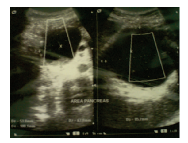
Figure 1. Transabdominal ultrasonography revealed pancreatic cysts.

shown ( Figure 2 ). These findings were highly suggestive of pancreatic cystic lesion causing stenosis of the CBD and obstructive jaundice. Swelling of the pancreatic cysts around the CBD had caused severe stenosis and sludge of bile had formed, resulting in obstructive jaundice.