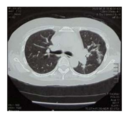
Figure 3. Consolidation in the left lungs from chest CT scan.