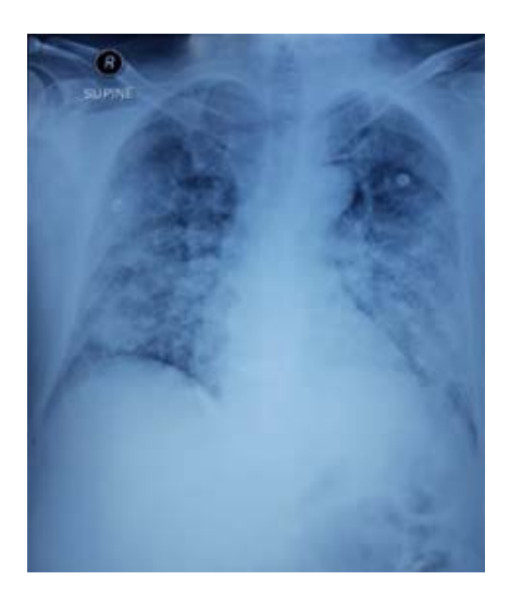
Figure 4. Diffuse consolidation of both lungs found in chest x-ray.

minute, pulse oxymetry 95%. Minimal rhonchi on the left lung was found from chest examination. Laboratory examination showed leukocytosis of 25.7 x 10^3 /mm<sup>3</sup>, lymphocyte count of 1.25 x 10^9 /L (normal), NLR of 15.84, elevated CRP of 108.9 mg/dL, elevated procalcitonin of 4.02 ng/ mL. Chest x-ray showed diffuse consolidation in both sides of the lungs ( Figure 4 ). CT scan revealed GGO, consolidation and reticular opacities in both sides of the lungs, along with bilateral pleural effusion ( Figure 5 ).