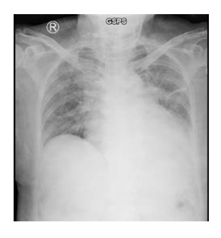
Figure 2. Infiltrates in both sides of lungs and cardiomegaly revealed on chest x-ray.

Physical examination obtained BP 70/40 mmHg, pulse 150 bpm irregular, RR 34 times per minute, O_2 saturation 98.5%. From chest examination, bilateral wet coarse rhonchi was acquired. Laboratory examination showed lymphopenia of 0.57 x 10<sup>9</sup>/L, NLR of 13.5, elevated CRP of 13.5 mg/L, elevated procalcitonin of 0.51 ng/mL. Chest x-ray revealed infiltrates in both sides of lungs and cardiomegaly ( Figure 2 ). Chest CT scan was also performed on patient with a result of consolidation in the left lung ( Figure 3 ).