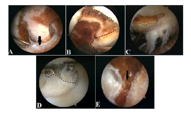
Figure 4. (A) Intercondylar notch with ACL and PCL deficiency (arrow), (B) Bone defect sized 4x5 cm at lateral femoral condyle, (C) ICRS grade IV cartilage defect size 1x3 cm at medial femoral condyle, (D) ICRS grade II cartilage defect size 4x4 cm at tibial plateau, (E) after synovectomy, synovial membrane without villous hyperthrophy.

bilateral crutches. On the next day, patient was discharged. Patient routinely came to The Haematology Clinic every three days to get factor VIII replacement therapy.