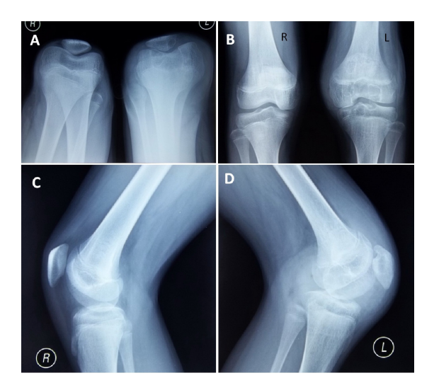
Figure 2. Plain X-ray of the left and right knee; (A) sunrise view, (B) weight bearing anteroposterior view, (C) lateral view.

(900 unit/day) until the bleeding stops. The patient received 450 cc packed cell transfusion before surgery and preoperative haemoglobin level was 10.0 g/dl. After anaesthesia, we performed an intraoperative physical examination, range of motion was 10-135^{\circ} , varus and valgus stress test was negative, anterior and posterior drawer test was positive, Lachman test was +3 (more than 10 mm).