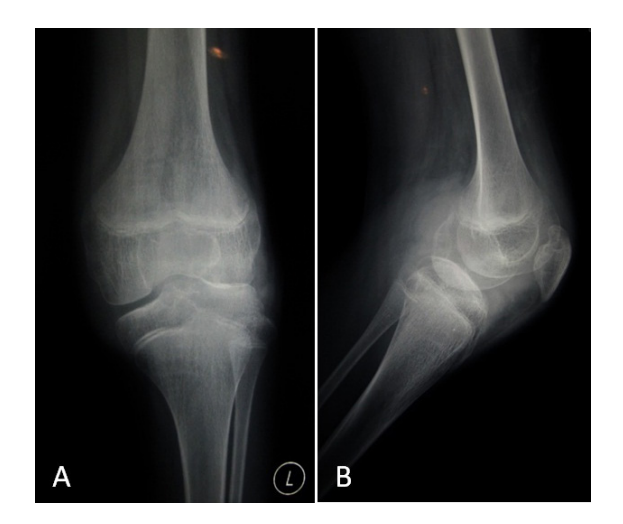
Figure 7. Plain X-ray 6 weeks after surgery; (A) anteroposterior standing view, (B) lateral view.

femoral condyle, and subchondral cysts ( Figure 7). The patient underwent physiotherapy twice a week in our hospital's medical rehabilitation center. Six months after the operation, pain was minimal (VAS 1-2), patient walked without crutch, range of motion was 0-125°, IKDC score