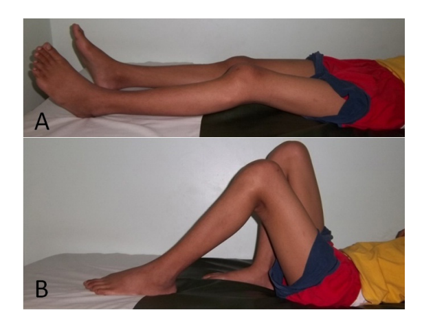
Figure 5. Clinical picture of the knee 3 weeks after surgery; (A) maximum extension, (B) maximum flexion, range of motion was 20-90°.