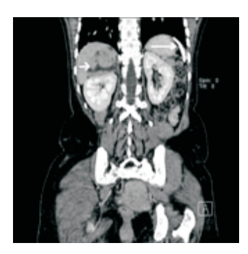
Figure 4. Coronal MPR image showing the supra renal mass (short arrow) and the calcified mass in the splenic fossa (long arrow). Note that the spleen is not visualized in the splenic fossa.

Blood examination revealed hemoglobin of 8.4 gm/dl and red blood cell count of 3.02 \times 10^{6/} microlitre. The mean corpuscular volume, MCH and MCHC were 81.7 fl, 27.8 pg and 34.0 gm/ dl respectively. Few target cells and sickle cells were also seen. Hemoglobin electrophoresis revealed an Hb S of 86.4%, Hb A2 of 3.3% and Hb F of 6.5% thereby confirming a diagnosis of sickle cell anemia. At the time of submitting the case report for publication the patients is undergoing pre surgical workup for removal of the adrenal tumour.