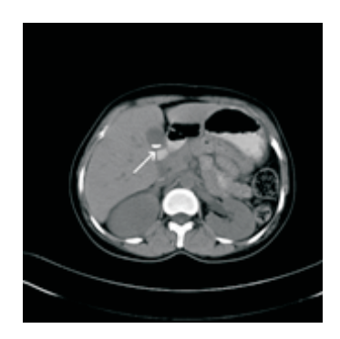
Figure 2. Axial plain CT scan image showing multiple hyper dense calculi in the gall bladder.