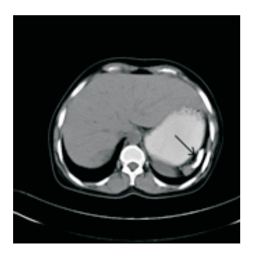
Figure 3. Axial plain CT scan image showing a calcified mass in the splenic fossa.