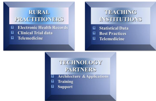
Figure 2. Roles and Responsibilities of Participants

Privacy of data and interoperability are some of the challenges that rural practitioners would encounter while using general health information systems [15]. The challenge of privacy is not only for the patients, whose infor-