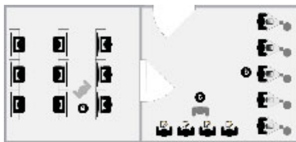
Figure 2. Test mechanics.

The first step was to explain the test to the class and if they agreed to take part of the evaluation, to give them some time to read and sign the informed consent document. In this presentation, it was stressed that the students' knowledge of chemistry was not under evaluation, that the aim was to evaluate the game and that they were free to choose not to participate. After this presentation, the teacher helped the class with an assignment that was not related to the subject of the game in one of the laboratory rooms (Fig. 2.a). Groups of five students were then invited to a neighbouring room to play the game. In this second step, each student was accompanied by a moderator, who provided the student with a cell phone (a Nokia C3, a Nokia E63 or a LG C570), as shown in Fig. 2.b. The moderator briefly reminded the students of the test mechanics, that questions about the game or about chemistry would not be answered and that the interaction would be