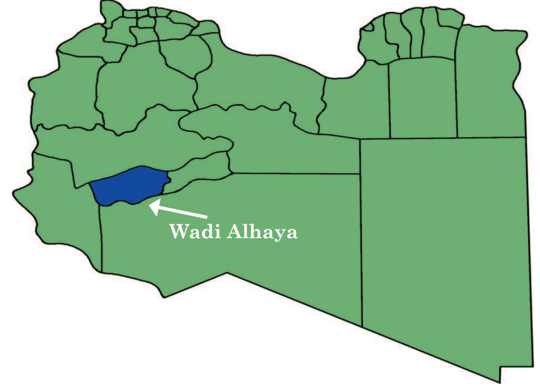
Figure 1 – Map shows the study area

The questionnaires were in prepared in English language and then the researchers have translated it into Arabic language to ensure getting enough feedback because most of the contactors who are running their business there are mostly speaking the local language (Arabic language). Moreover, the data were collected by firstly using close ended self-administered questionnaires. And then, this study was employed survey method to obtain the perceptions of the respondents toward the critical success factors for construction projects in Libya. Out of the 80 administered and only 44 useable questionnaires were returned, which produced 52.5% responds rate which is a quite high when compared with previous studies. The collected data were analyzed with aid of Statistical Package for Social Science (SPSS) version 17.0. The data were analyzed in the following order. First, the demographic profile of firms and respondents were analyzed using descriptive statistics. Followed by, indices the Relative Importance Index (RII).