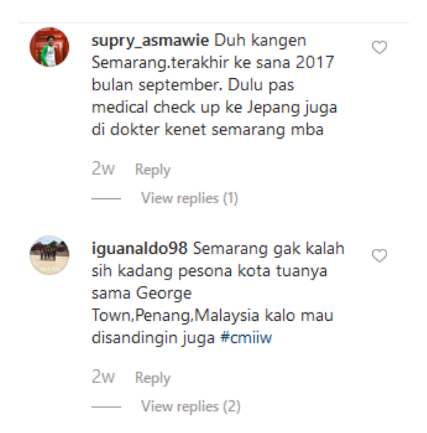
Figure 9: Comments from followers of @trinitytravel regarding paid content posted

Thus, followers who have the same passion as influencers will interact, even share their own experiences to respond to content posted by influencers.