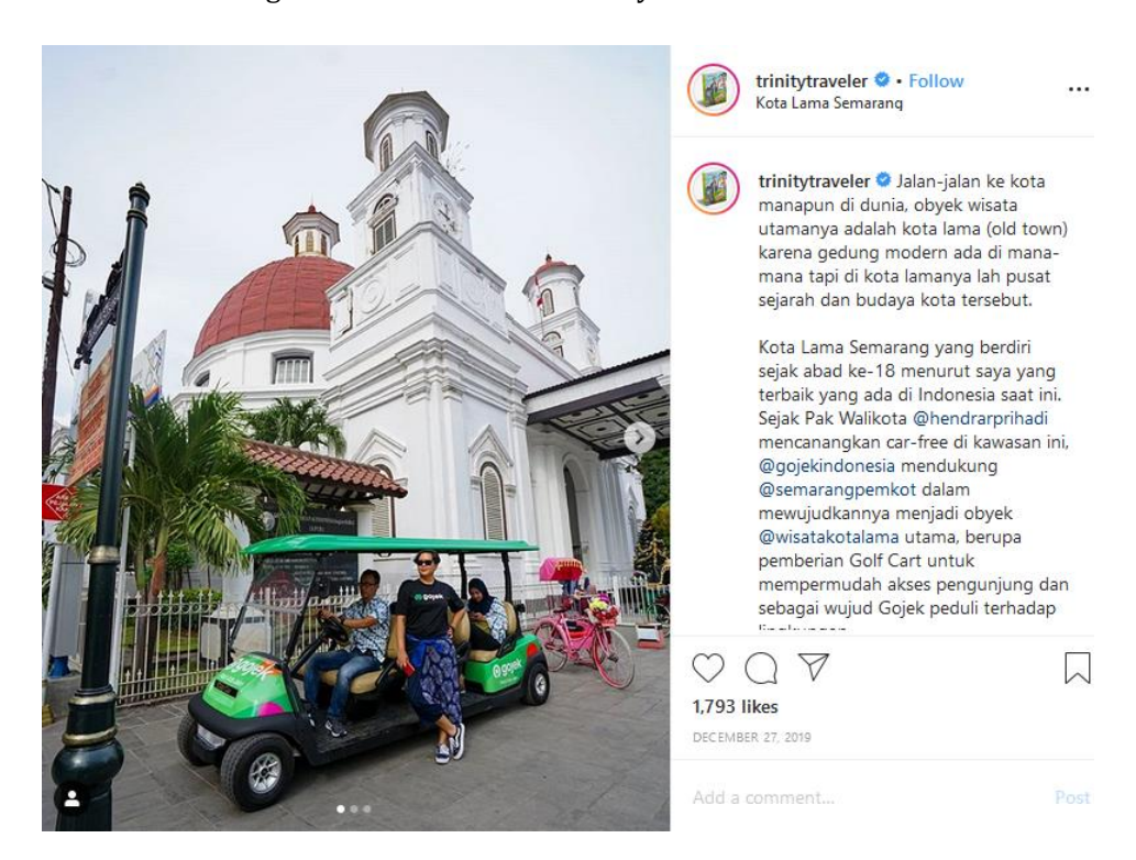
Figure 8: Paid content in @trinitytraveler account

For example, the followers of Felix Setiawan @kokokuliner in Figure 6 can be said to be culinary fans seen from the interaction patterns and comments given in Figure 7, in this case the follower provides comments on Instagenically packaged food, as well as the desire to participate in tasting the culinary influencers @kokokuliner.