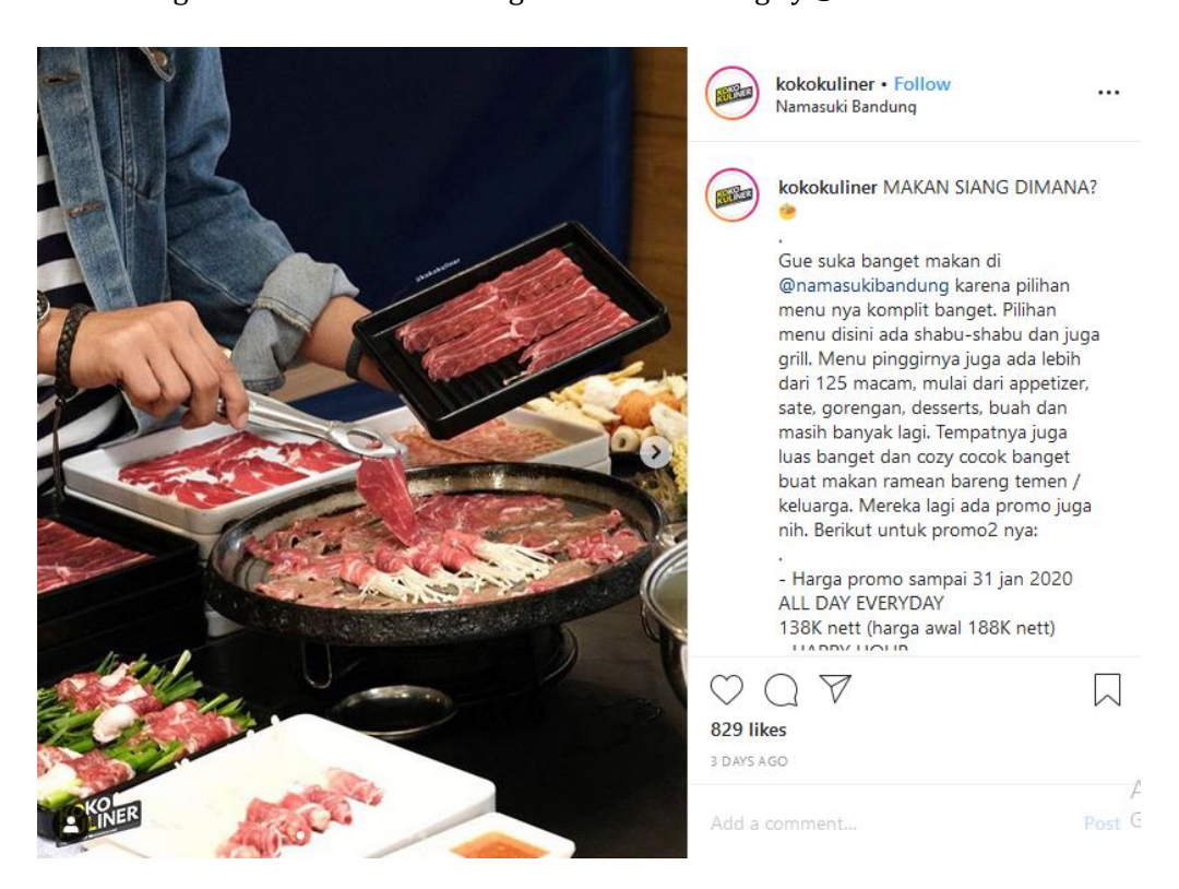
Figure 6: Influencer Marketing Namasuki Bandung by @kokokuliner

themselves, so these two samples were selected because they were considered the most suitable for analyzing this topic.