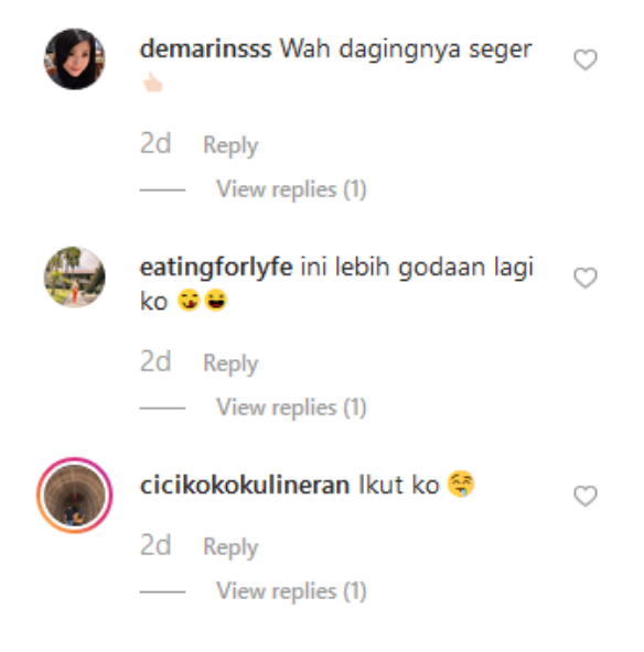
Figure 7: Followers respond relate to @kokokuliner's content