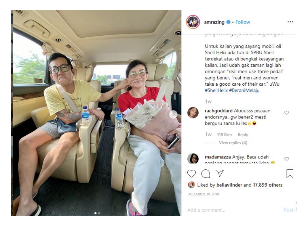
Figure 4: Sponsored Content in @amrazing account

Through the @amrazing post, it can be seen that Alexander's approach is very personal to the product or service being promoted, which raw data we attach on the attachment.