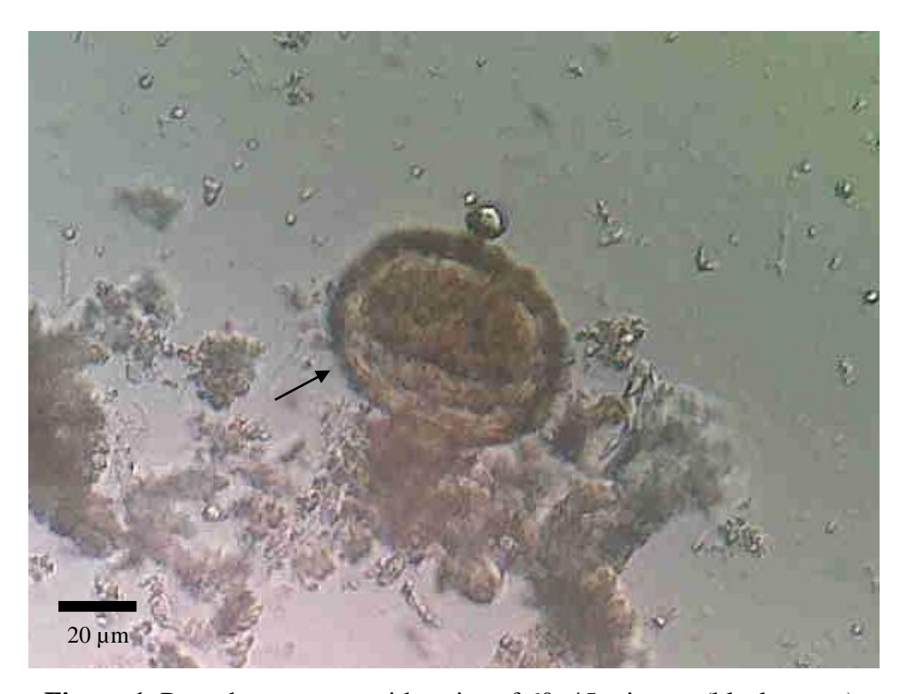
Figure 1. Roundworm eggs with a size of 60–45 microns (black arrow).

The results of the identification of parasites in the nail samples of Sumber Urip 1 farmers, Wonorejo Village, Poncokusumo District, Malang Regency using the