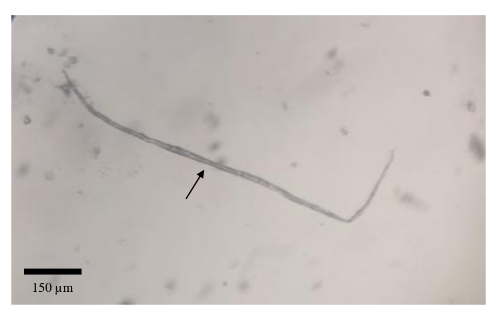
Figure 2. Hookworm larvae with a size of 600 x 25 microns (black arrow).