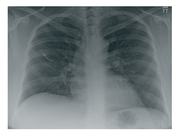
Fig. 1. Chest X-ray exhibiting centrilobular pulmonary nodules and pulmonary cysts with prominence in the bilateral upper lobes and reticular and nodular opacities consistent with Langerhans Cell Histiocytosis.