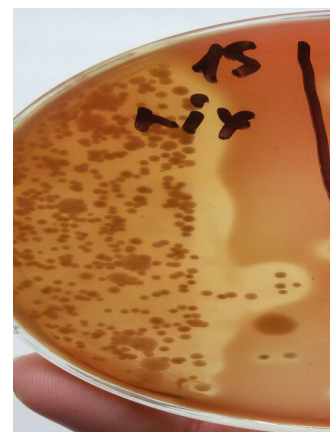
Fig. 2. Cultures of microorganisms on Petri dishes (bloods MPA medium)

- on the skin of mammary glands: M. sedentarius , St. hominis , M. roseus , Lactobacillus , Gamma-hemolyticus streptococcus – in 7%; M. varians , Bacillus spp. – in 13%; Co-