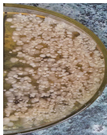
Fig. 3. Cultures of microorganisms on Petri dishes (ZHSA medium)