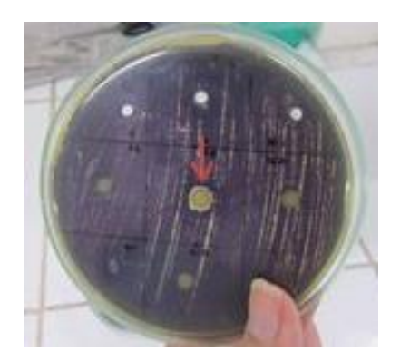
Figure 1. Positive result of the quorum quenching assay of KM16 isolate (red arrow)

It was found out that bacterial isolates KM16 (Figure 1) and PAP26 had quorum quenching activity. Quorum quenching activity can be achieved by inhibiting signal synthesis, degradation of the signal molecule, and preventing signal molecule binding to transcriptional factors (Grandclément et al. , 2016).