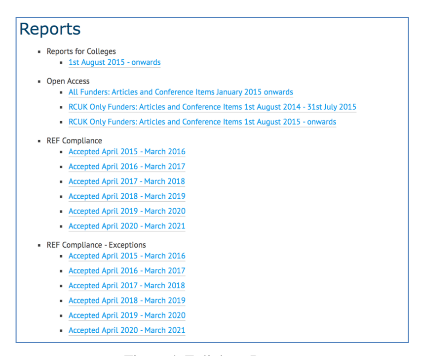
Figure 4. Enlighten Reports

We can also export reports directly from Enlighten which we use to discuss progress towards open access with our Colleges and Schools, and which we can provide to research funders who want to know how well our researchers are complying with their open access policies. See Figure 4.