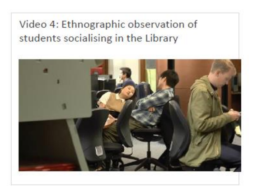
Figure 5. Photograph of Students Socialising in the Library

Figure 5 is a photograph of students socialising in the Library.