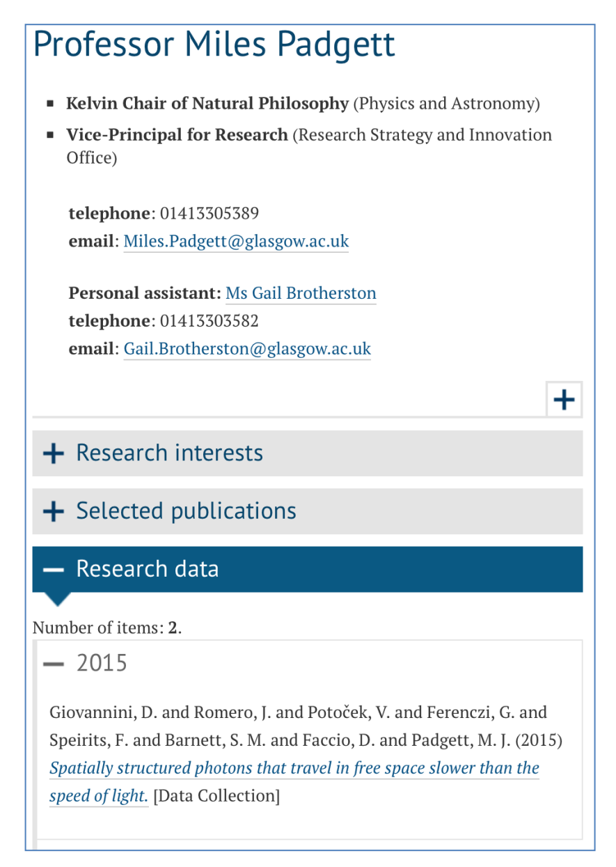
Figure 2. Staff profile page

lists of publications and research datasets dynamically pulled from Enlighten (University of Glasgow, n.d.). See Figure 2.