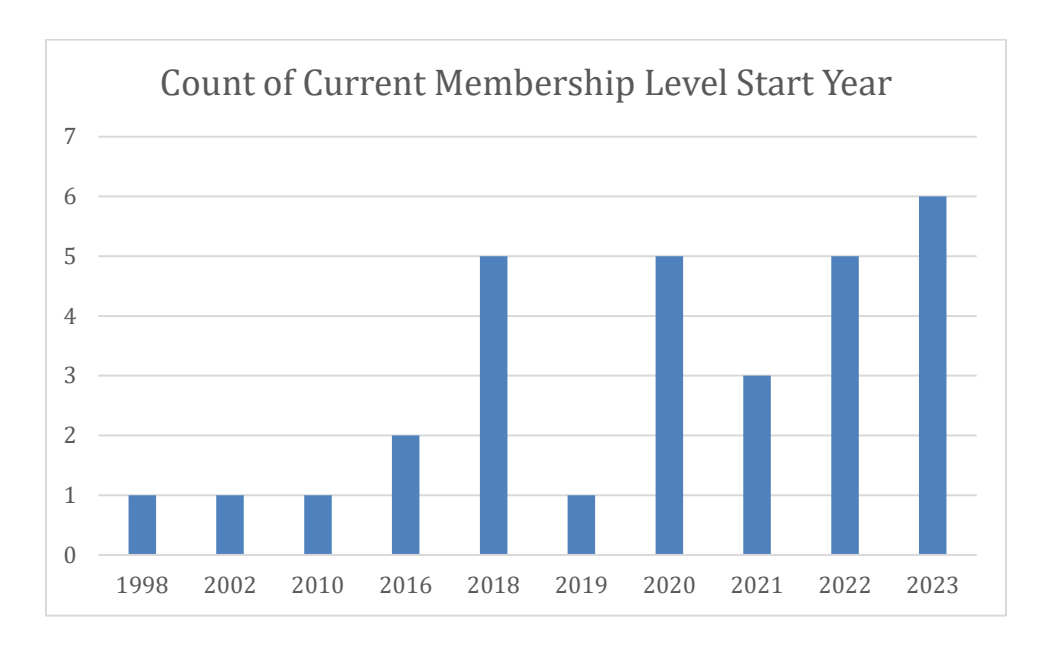
Figure 2. Number of members by current membership level start year