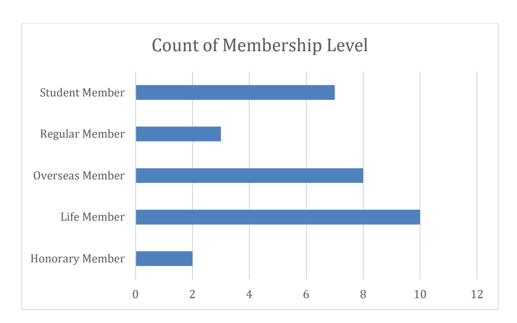
Figure 1. Number of members by membership level