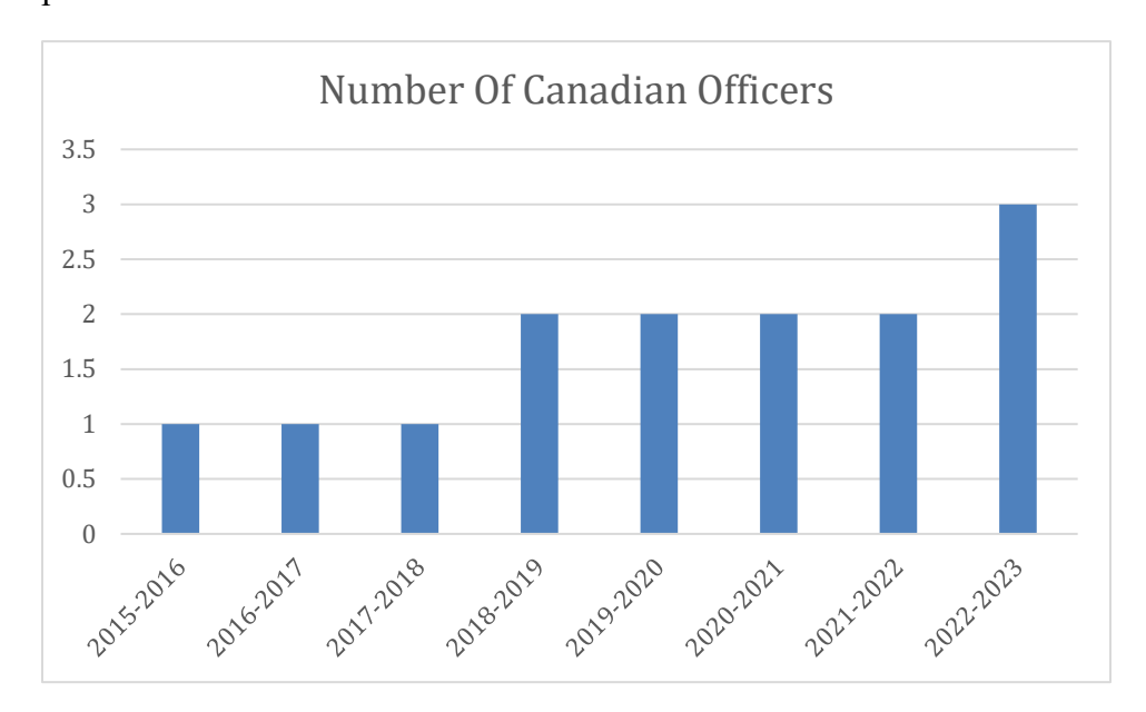
Figure 4. Number of Canadian Officers by Year

Since the establishment of the Chapter in 2018, there has been a noticeable increase in the involvement of Canadian members in CALA, as shown in Figure 4. In the most current year, 2022-2023, three Canadians are serving on the CALA Board of Directors, including one member on the CALA Executive Committee as the Incoming Vice President/President Elect for 2024-2025 (CALA, 2023a). This marks the first time a non-U.S. member has been elected as the President since CALA was founded in 1973. Additionally, a Canadian member is currently running for the position of President for the 2025-2026 term.