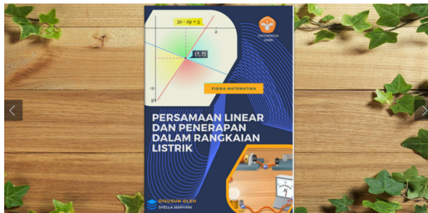
Figure 1. E-Module Cover Display

There has been a discussion about research to measure student perceptions of e-Modules as teaching materials. The update of this research is regarding the material contained in the e-Module, namely Mathematics Physics I material on Linear equations, the use of flipbook software using Flip PDF Professional and different samples and populations, namely Jambi University Physics education students who have contracted Mathematics Physics courses. I. The picture of the research can be seen from the picture below.