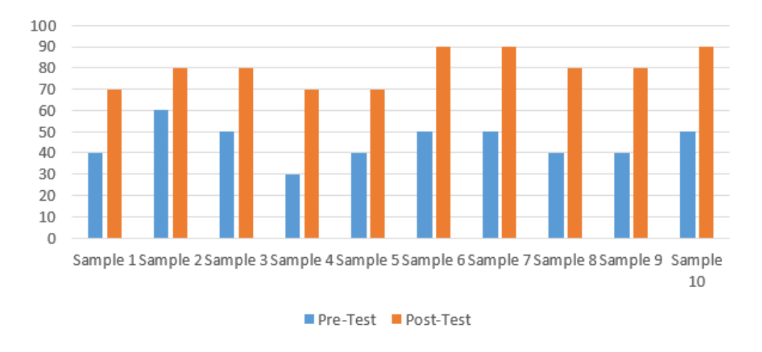
Figures 1. Pre-test and post-test results

Learning activities at the State Elementary School 2 Kasomalang are carried out online. The learning media used are through whatsapp group, and google meet. We conducted research using a questionnaire in the form of a gform. This form is disseminated to elementary school students via whatsapp group to find out how far the knowledge of volcanic disaster mitigation is to elementary school students, this research is to find out how much knowledge elementary school students have about disaster mitigation when the post test and pretest are carried out. When the post test has been completed, we conducts a literacy movement regarding the importance of mitigating the Merapi eruption disaster. Figures 1 describes the results of the pre-test and post-test which are depicted using graphs. Tables 2 describes an increase in each student during the pre-test and post-test.